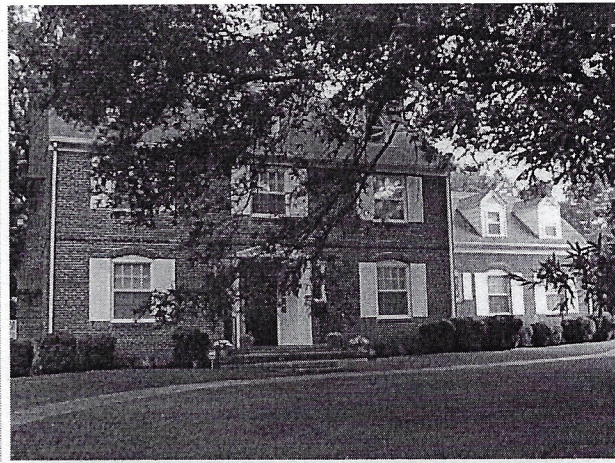
Main Structure Photo