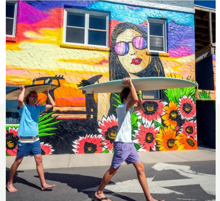
Colorful mural in Carolina Beach, which has become a draw for visitors from all over the state, particularly the R... as CVB)