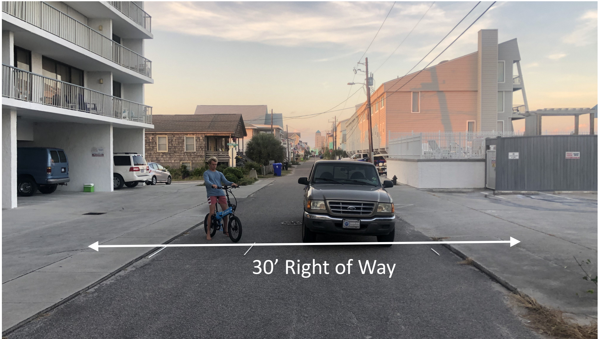
18' Road - Spartanburg (the narrowest pavement on the entire road)