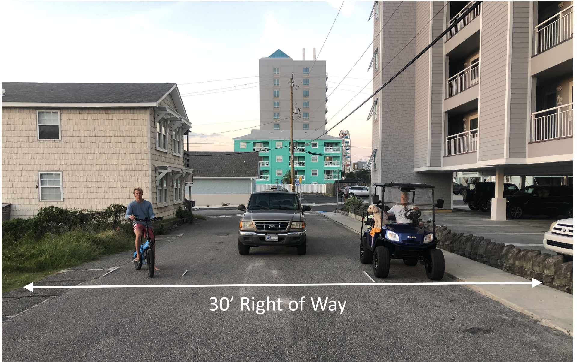
24.5' Road - Hamlet