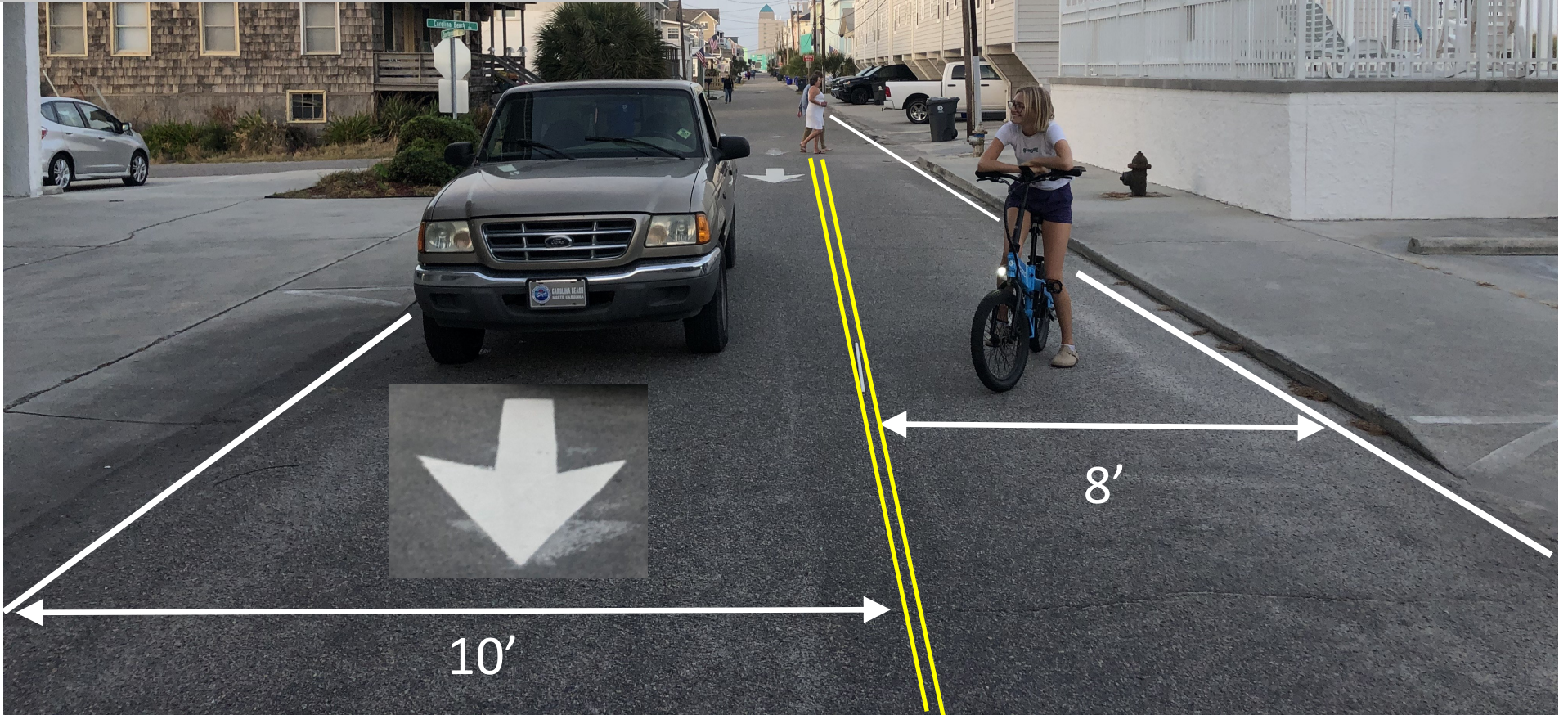
18' Road - Spartanburg (the narrowest pavement on the entire road)