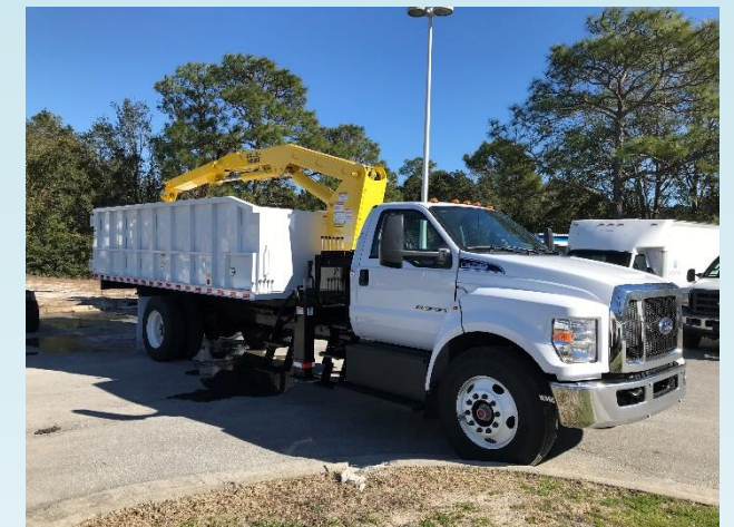
Replacement of Knuckleboom Debris Truck