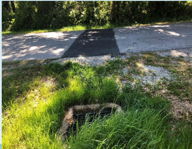
Many Stormwater Improvements Throughout Town