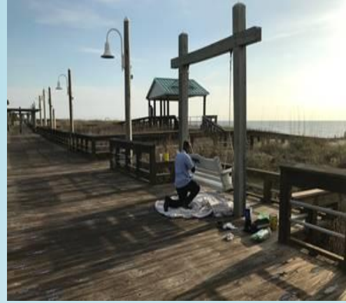
Staining and maintenance of Boardwalk And Marina docks prior to Summer