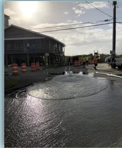
Flood control and prevention