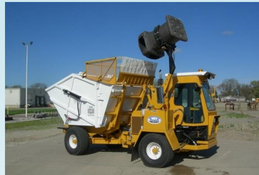
Replacement of Can Machine for Freeman Park and Beach Strand