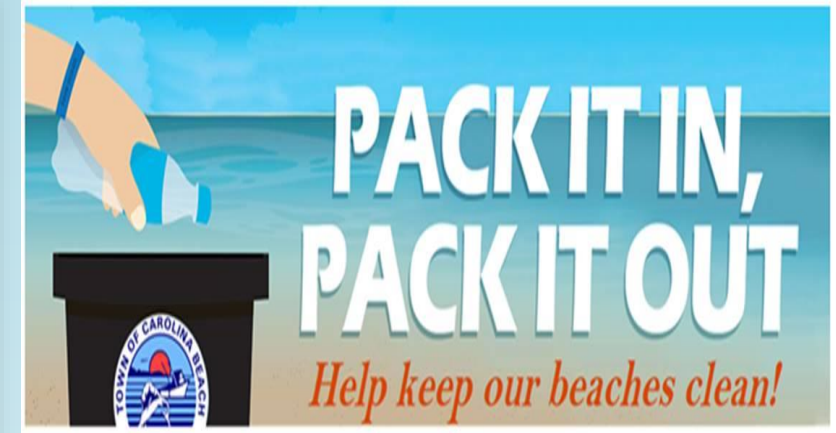
Implementation of the Pack it In, Pack it Out Program