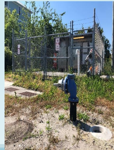
Emergency Bypass for Greenville SW Pumpstation