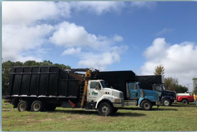
Debris management for Hurricane Isaias