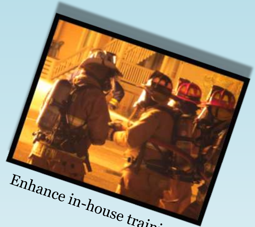
Enhance in-house training

Core Values: Service, Honor, Integrity, and Pride