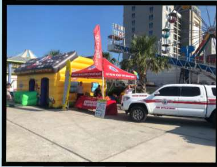
Enhance recruitment and retention