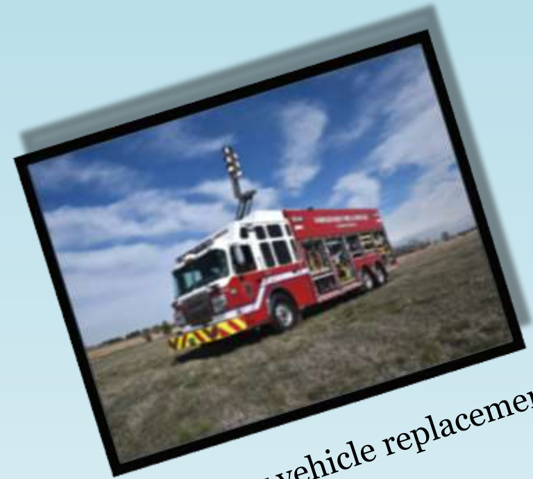
Emergency vehicle replacement