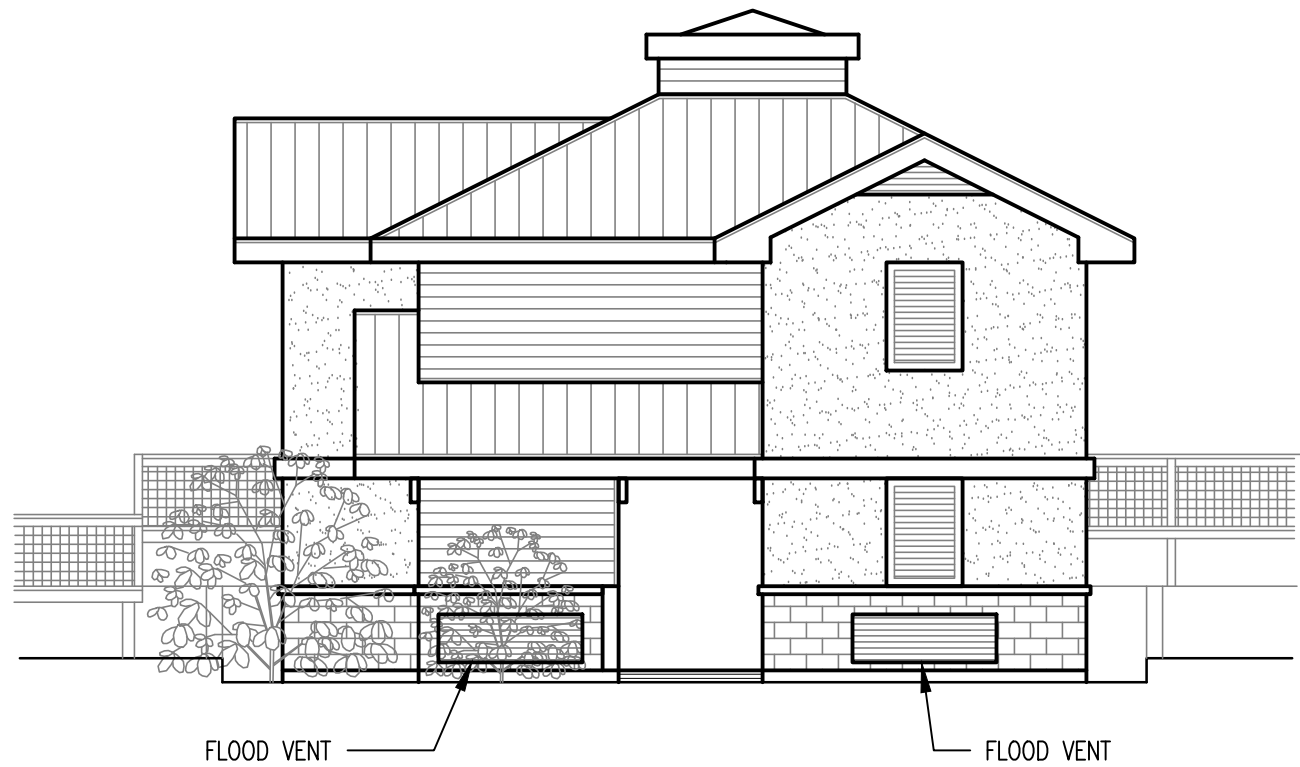
A WEST ELEVATION (option A) SCALE: 1/8"=1'-0"

BASE FLOOD ELEVATION (BFE) BASED ON FEMA FLOOD MAP NO. 3130. FLOOD ZONE = VE