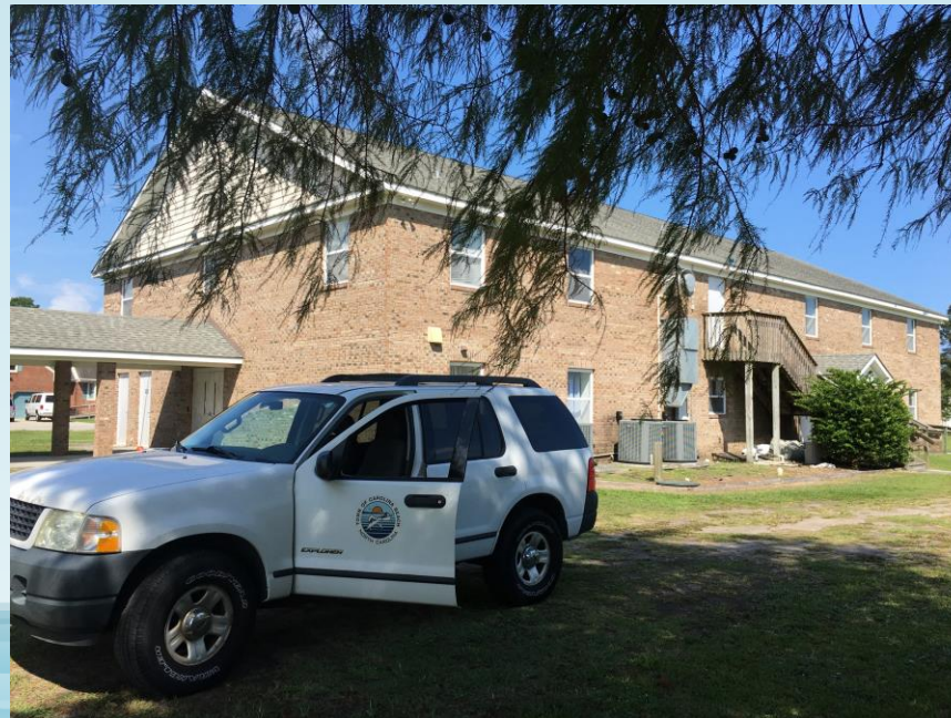
Structure for Day Care