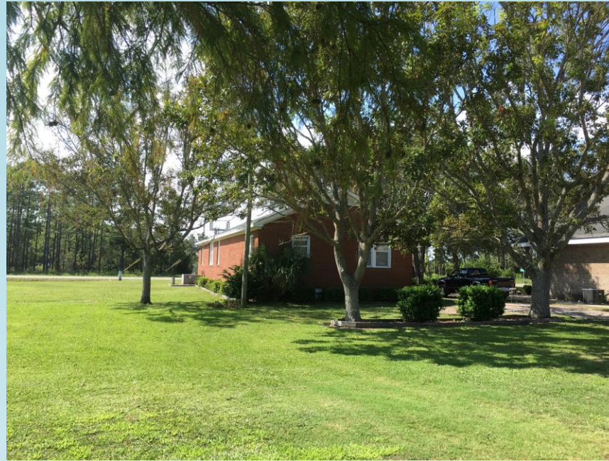
From Hamlet (Parking Lot)