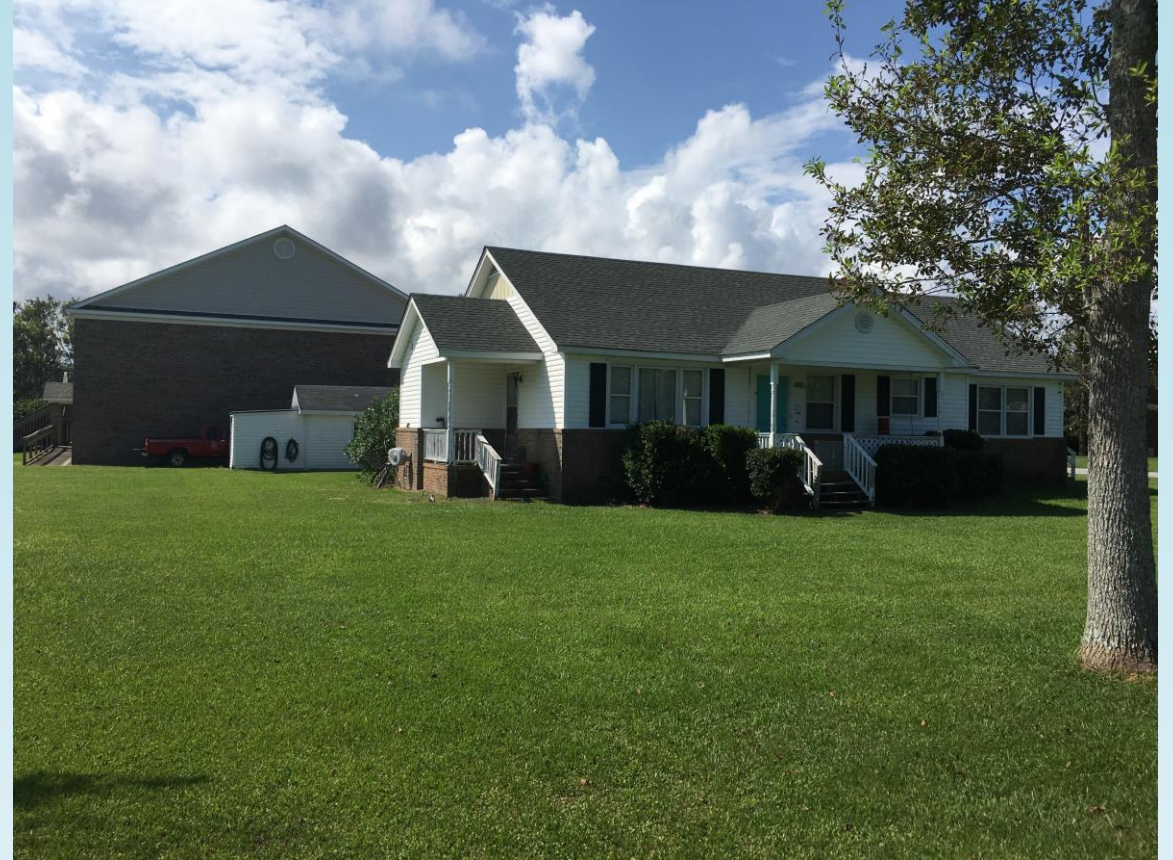
From 8 th Street