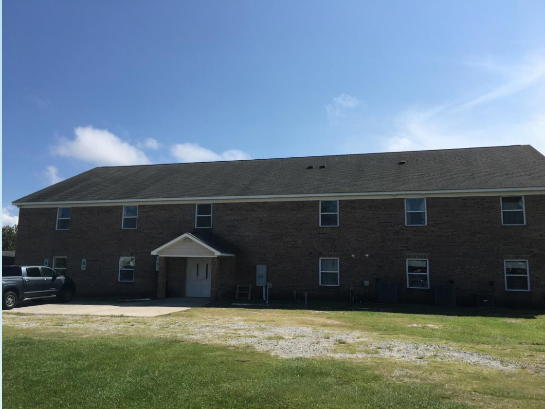
Structure for Day Care