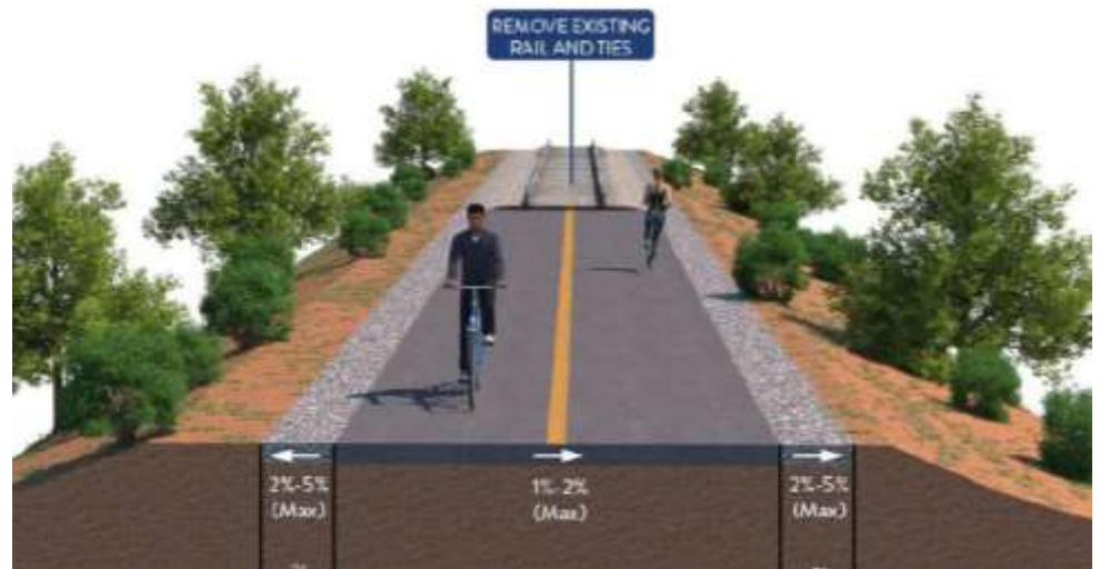
Interim Trail Configuration