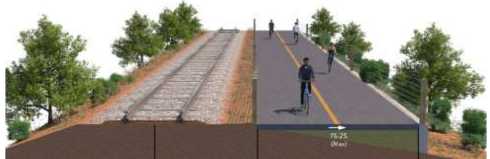
Ultimate Trail Configuration