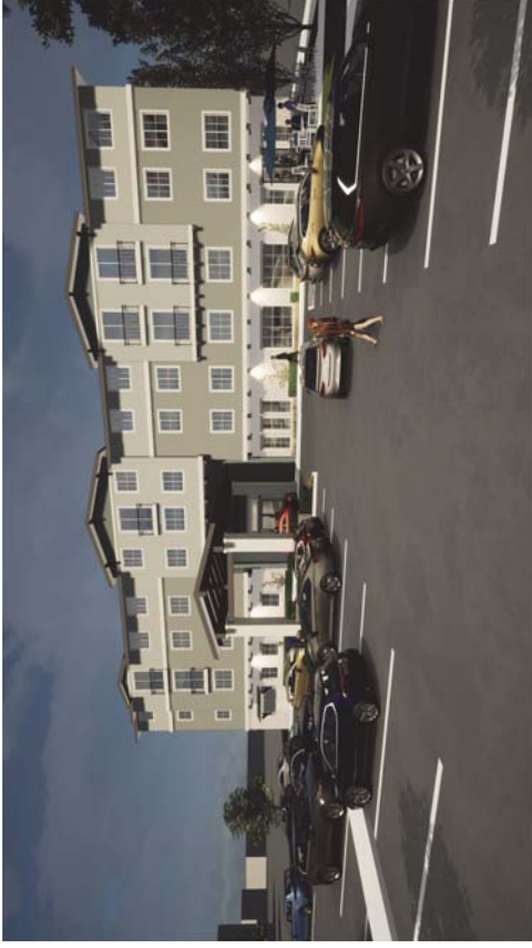
FRONT - SOUTH