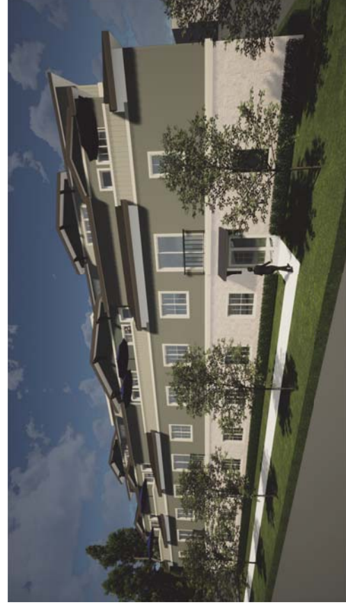
REAR - NORTH