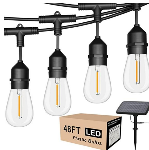
Deck mounted metal poles and LED string lights