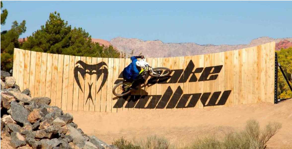
Figure 2. Wall Ride Feature

The proposed scope of work initiates with design services, which involve site visits, concept development, and final design, with an anticipated duration of approximately 8 weeks. Upon completion of the design phase, the project will transition to the manufacturing, installation, and construction phases, which are estimated to take between 4 to 6 weeks.