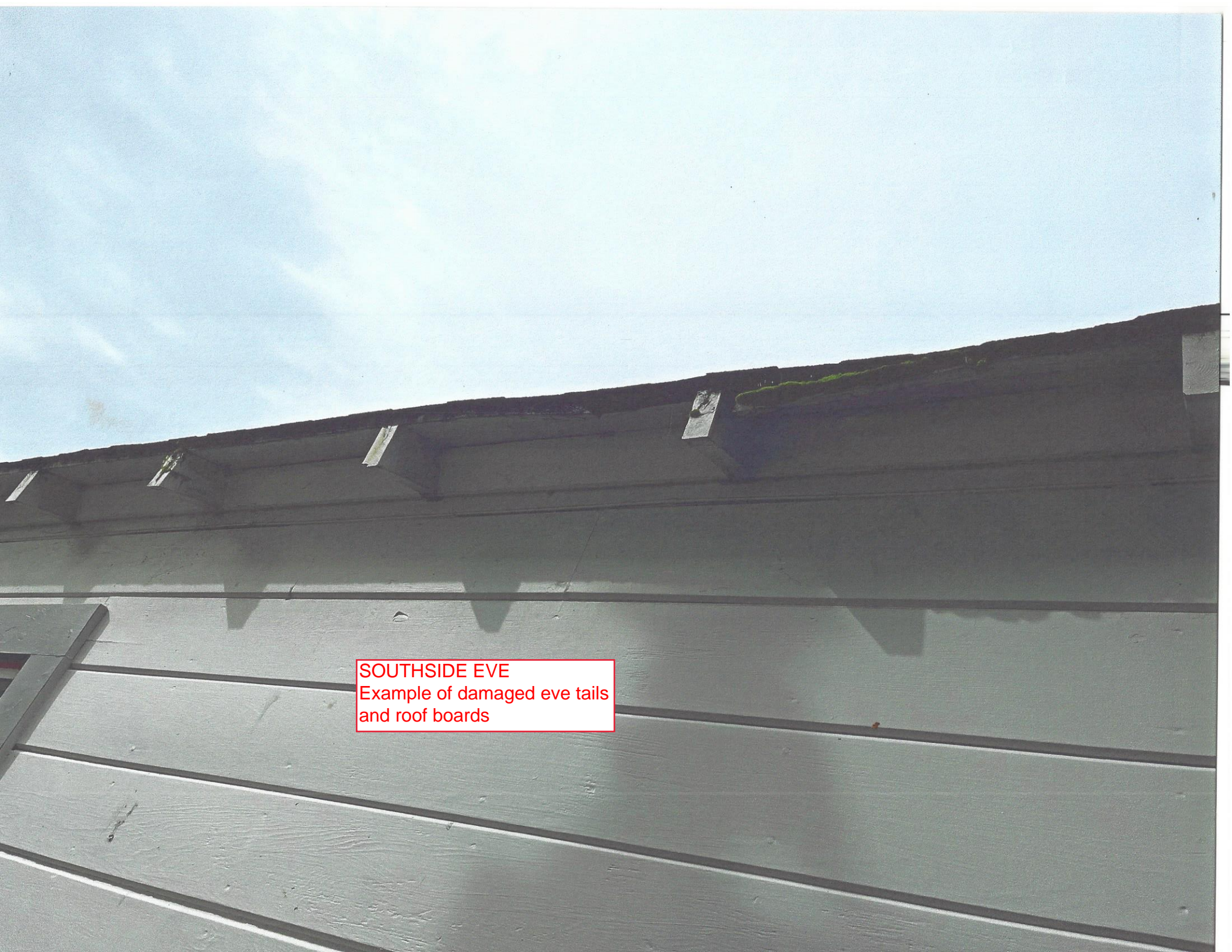
SOUTHSIDE EVE Example of damaged eave tails and roof boards