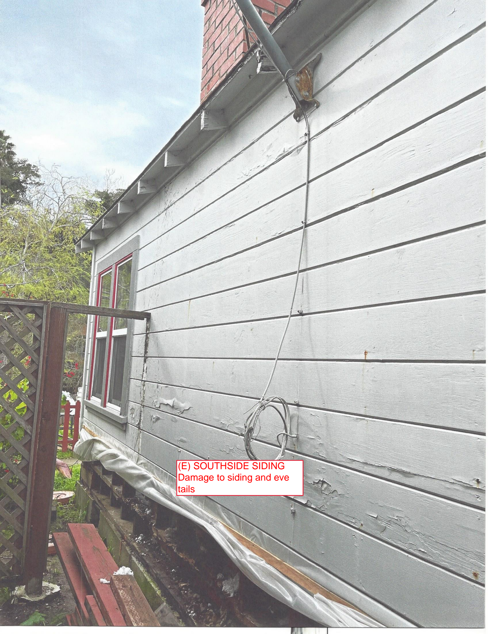
(E) SOUTHSIDE SIDING Damage to siding and eve tails