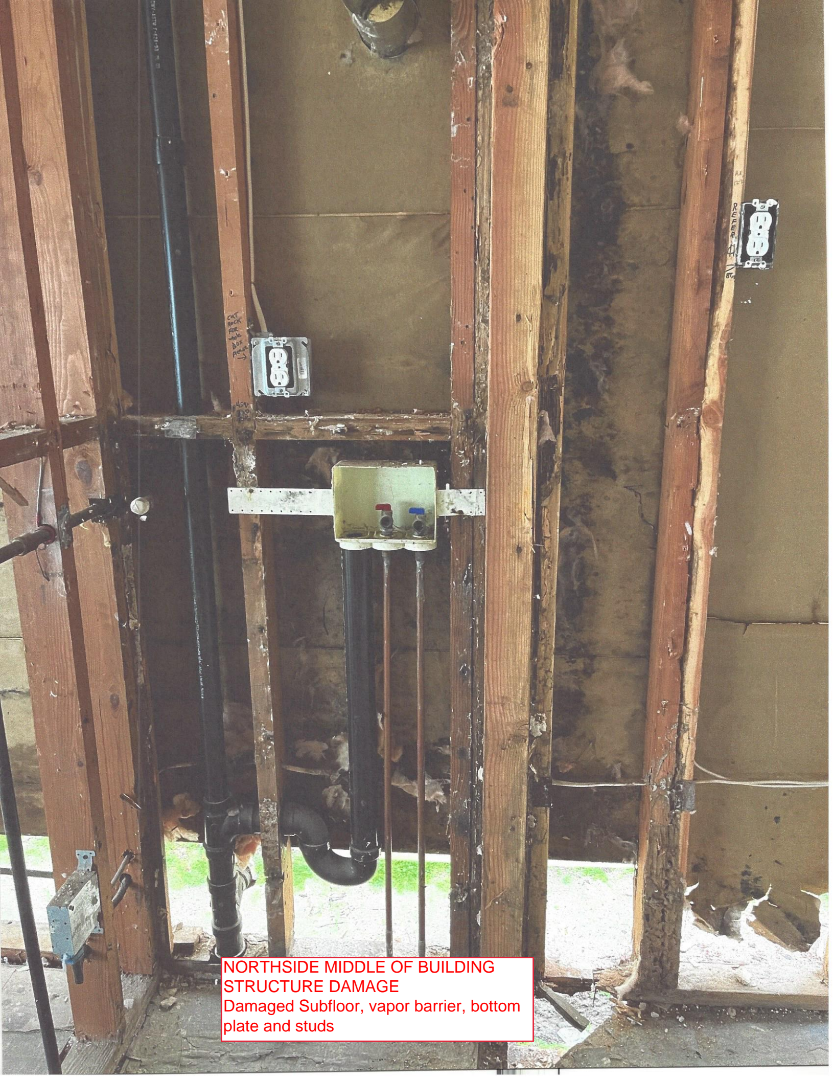
NORTHSIDE MIDDLE OF BUILDING STRUCTURE DAMAGE Damaged Subfloor, vapor barrier, bottom plate and studs