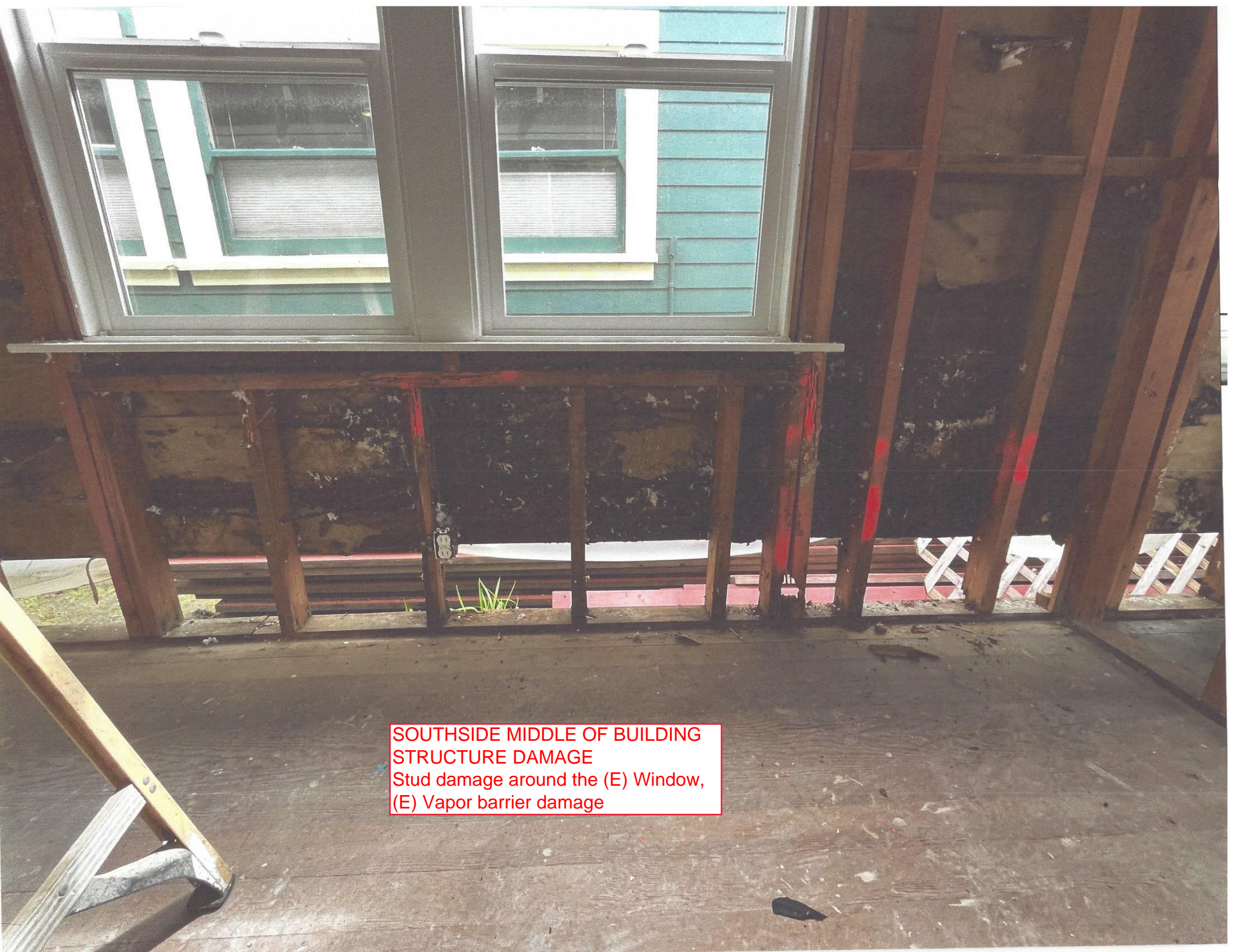
SOUTHSIDE MIDDLE OF BUILDING STRUCTURE DAMAGE Stud damage around the (E) Window, (E) Vapor barrier damage