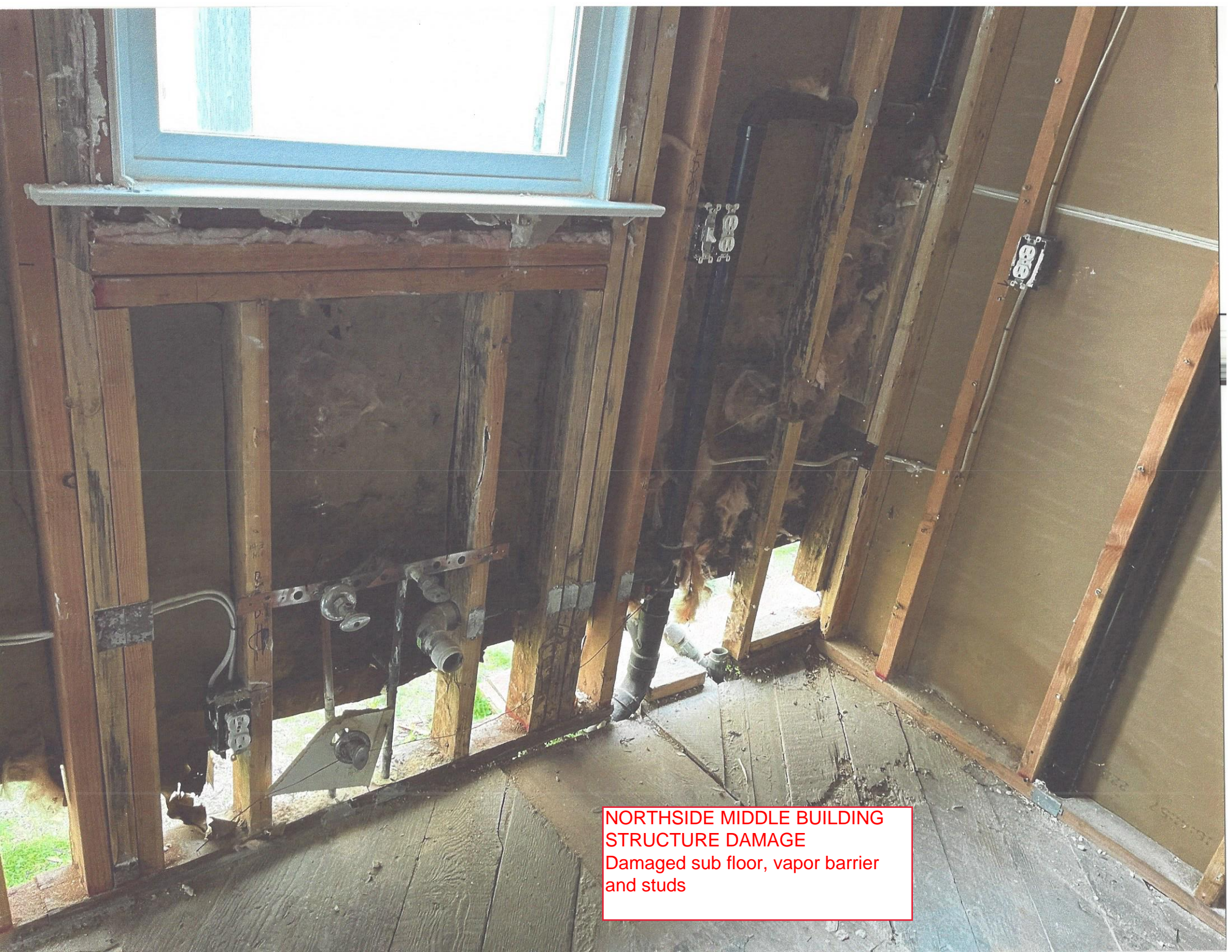
NORTHSIDE MIDDLE BUILDING STRUCTURE DAMAGE Damaged sub floor, vapor barrier and studs