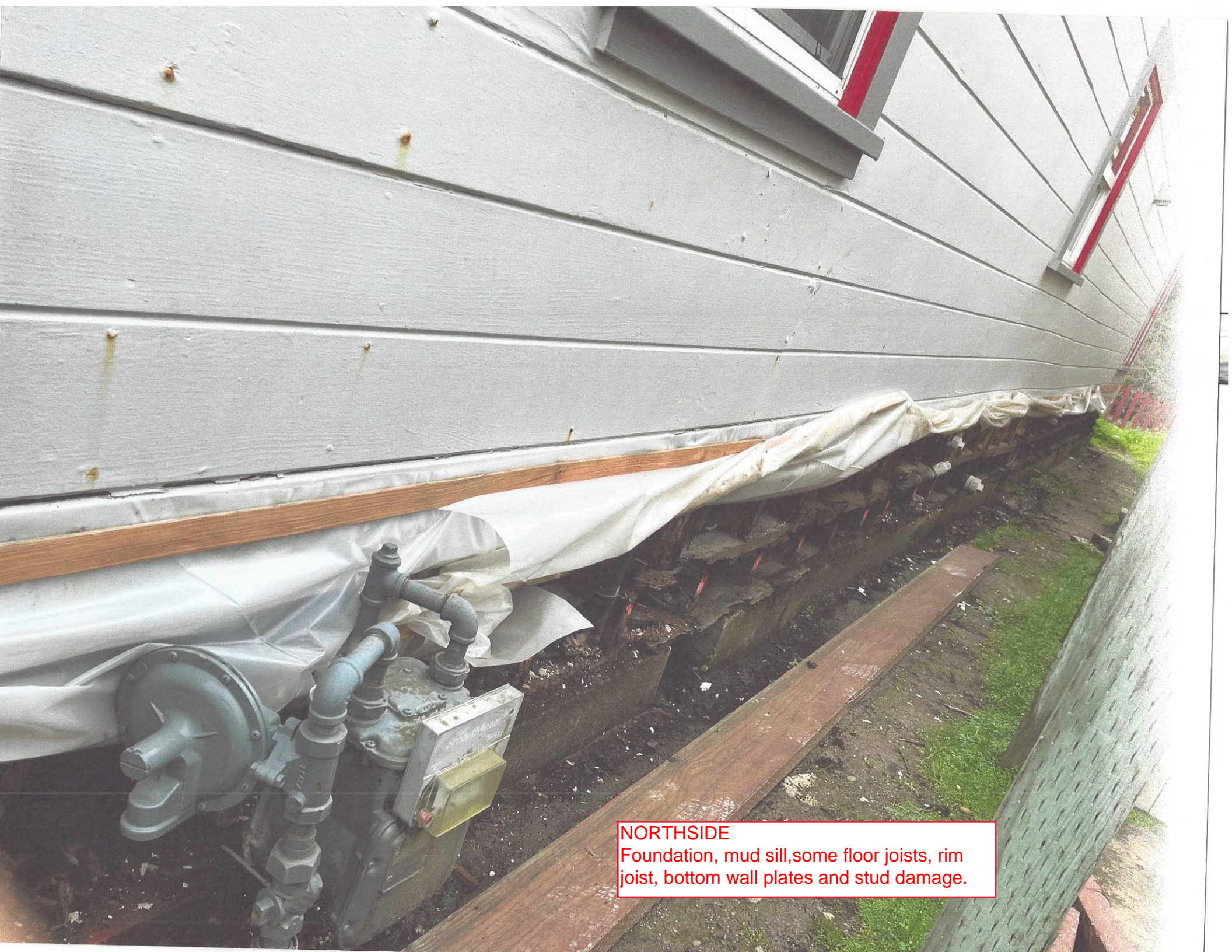
NORTHSIDE Foundation, mud sill, some floor joists, rim joist, bottom wall plates and stud damage.