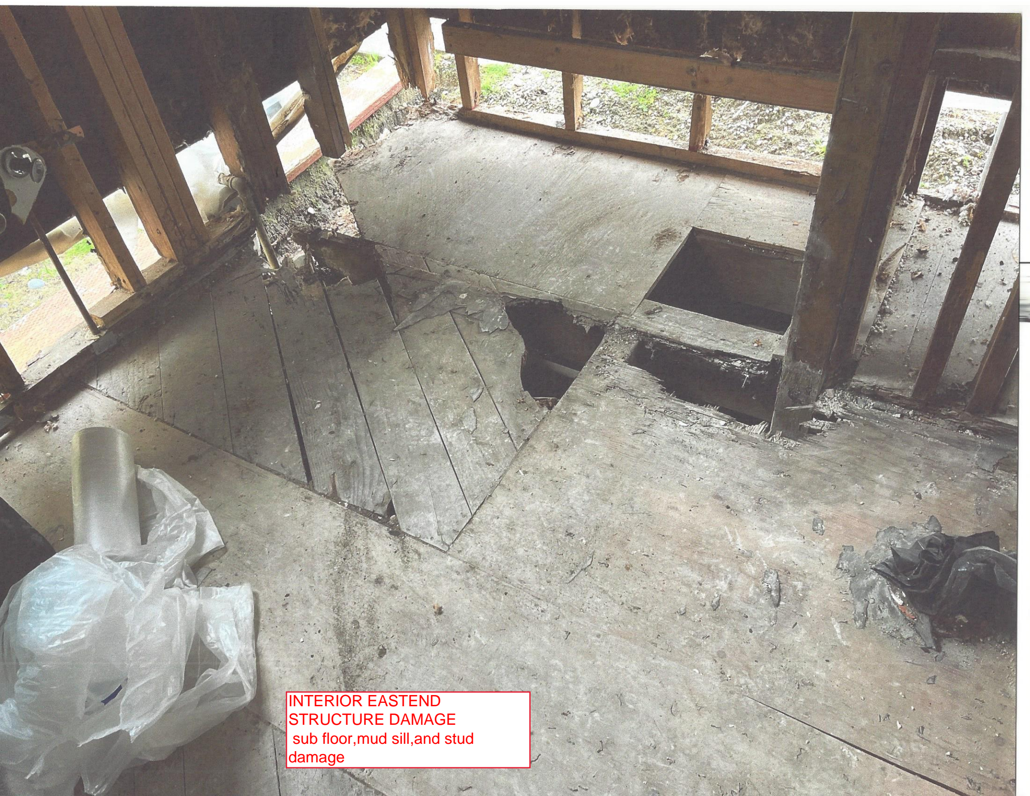
INTERIOR EASTEND STRUCTURE DAMAGE sub floor, mud sill, and stud damage