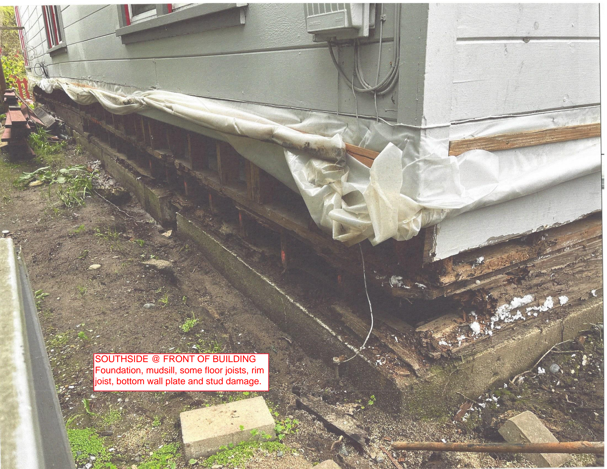
SOUTHSIDE @ FRONT OF BUILDING Foundation, mudsill, some floor joists, rim joist, bottom wall plate and stud damage.