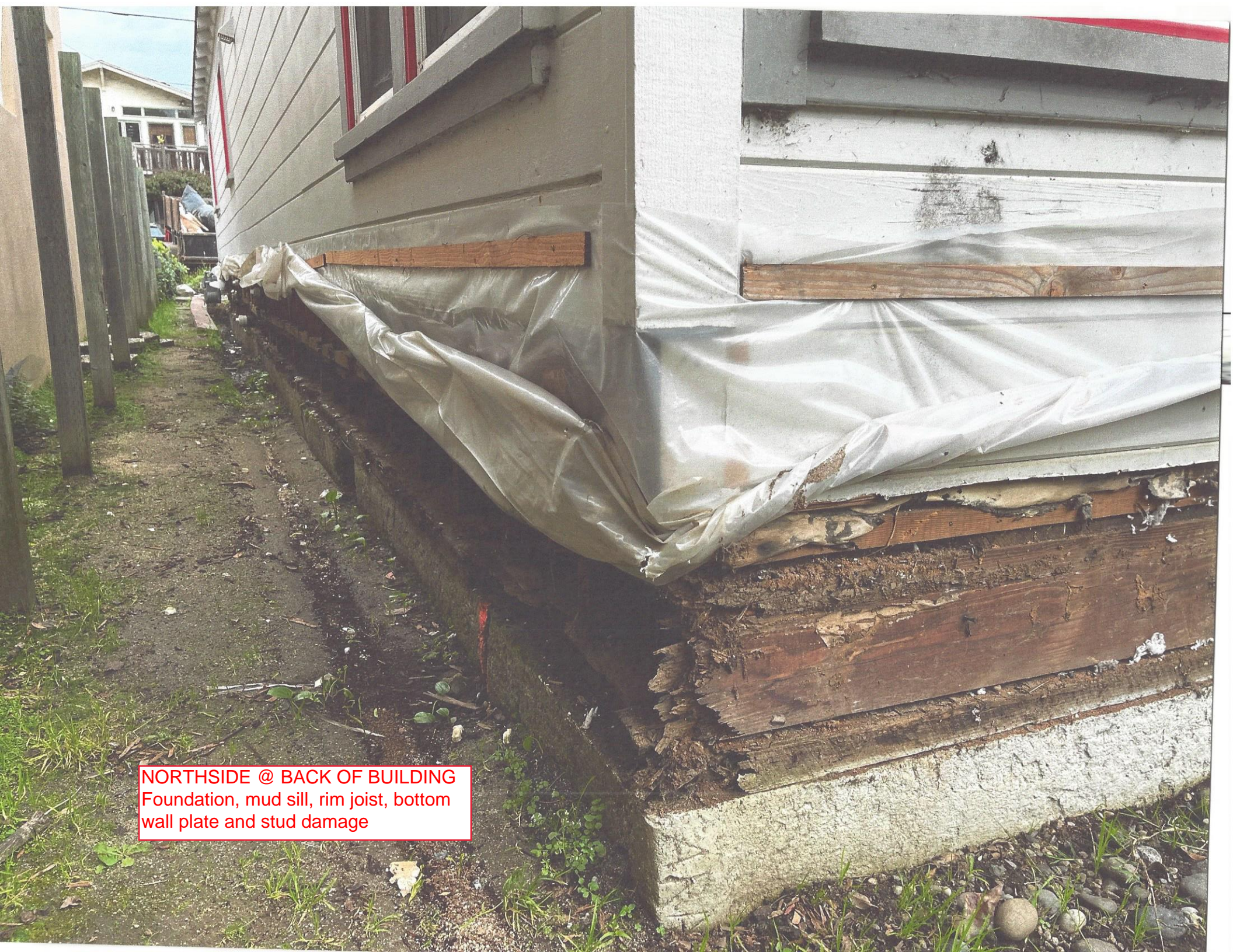
NORTHSIDE @ BACK OF BUILDING Foundation, mud sill, rim joist, bottom wall plate and stud damage