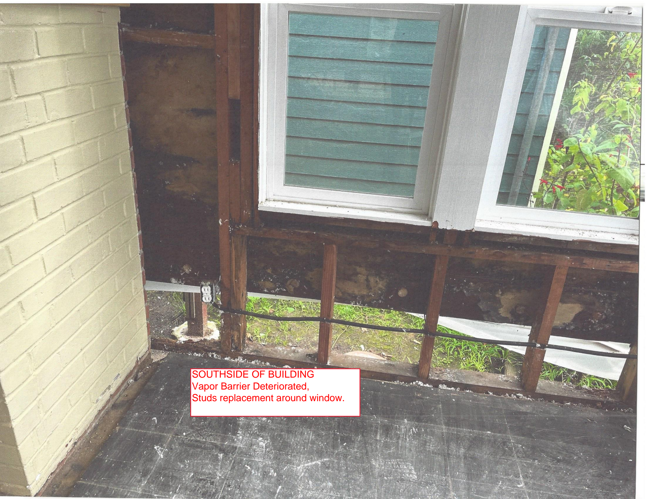
SOUTHSIDE OF BUILDING Vapor Barrier Deteriorated, Studs replacement around window.