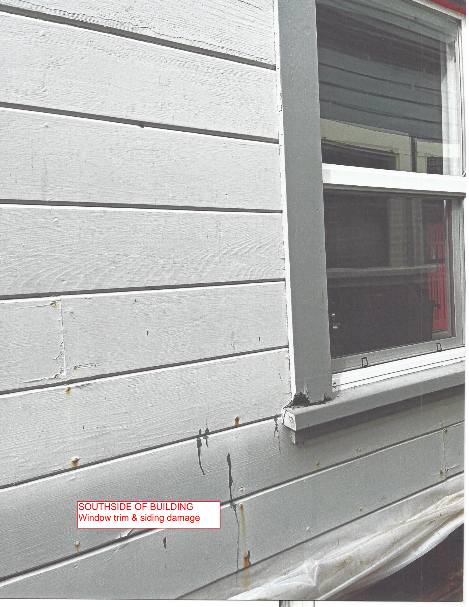
SOUTHSIDE OF BUILDING Window trim & siding damage