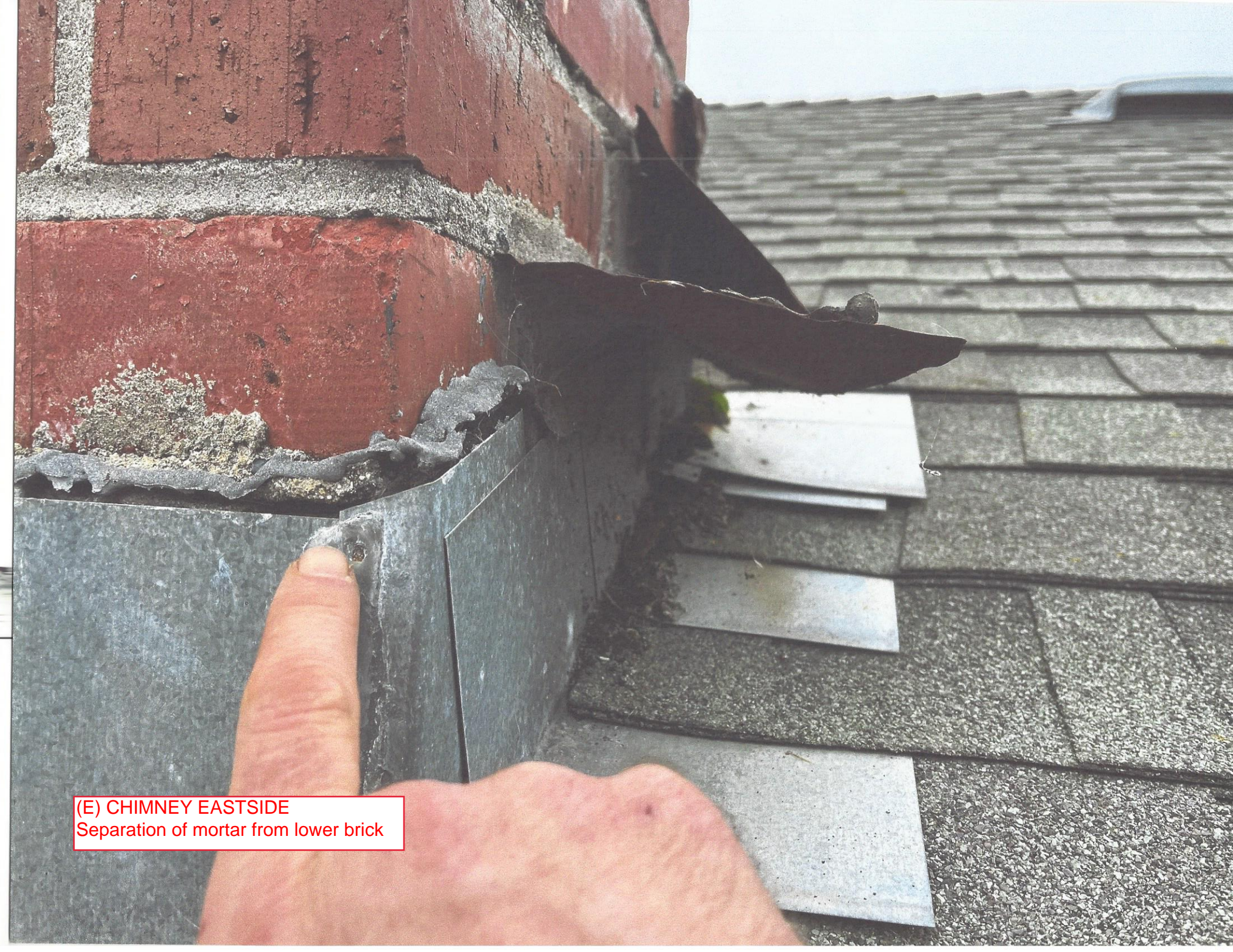
(E) CHIMNEY EASTSIDE Separation of mortar from lower brick