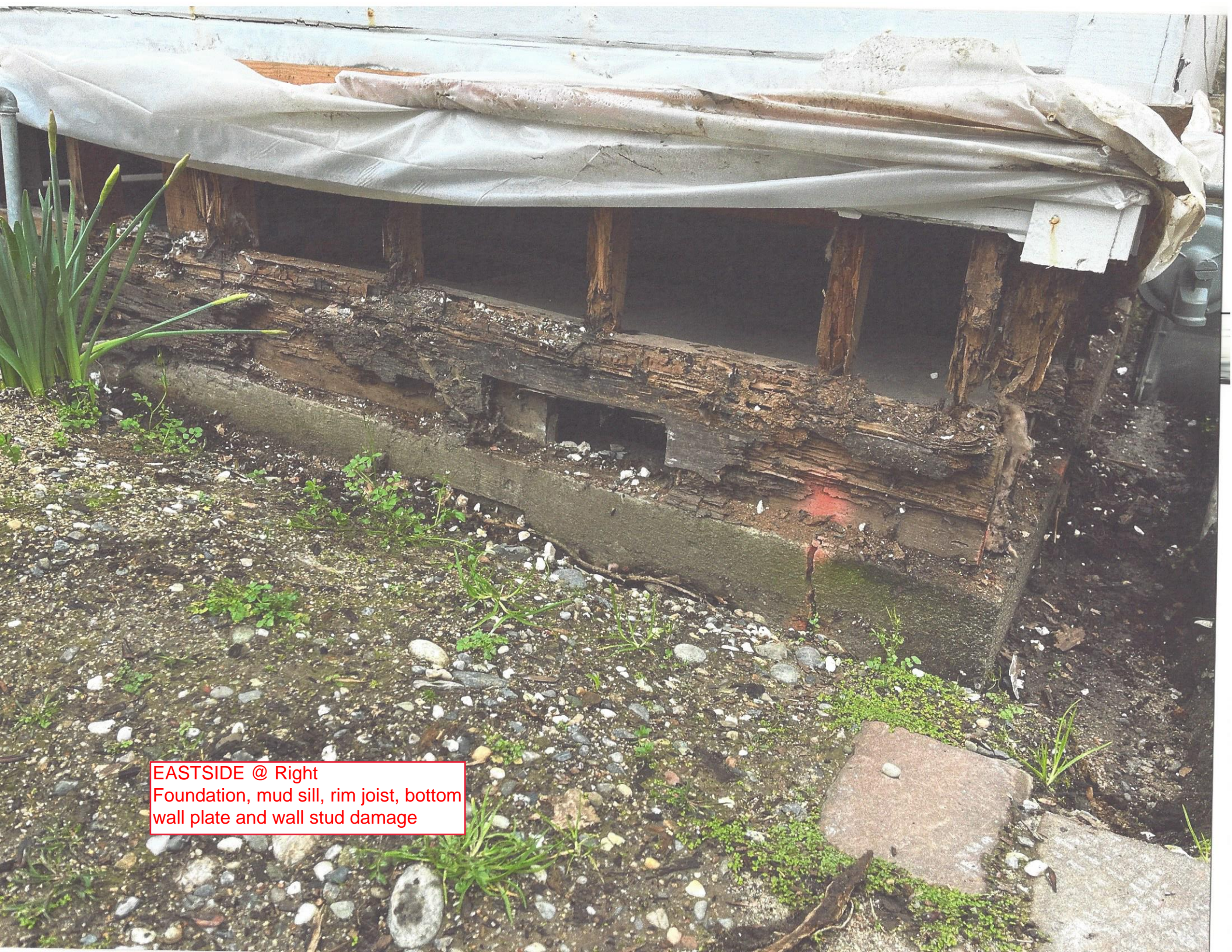
EASTSIDE @ Right Foundation, mud sill, rim joist, bottom wall plate and wall stud damage