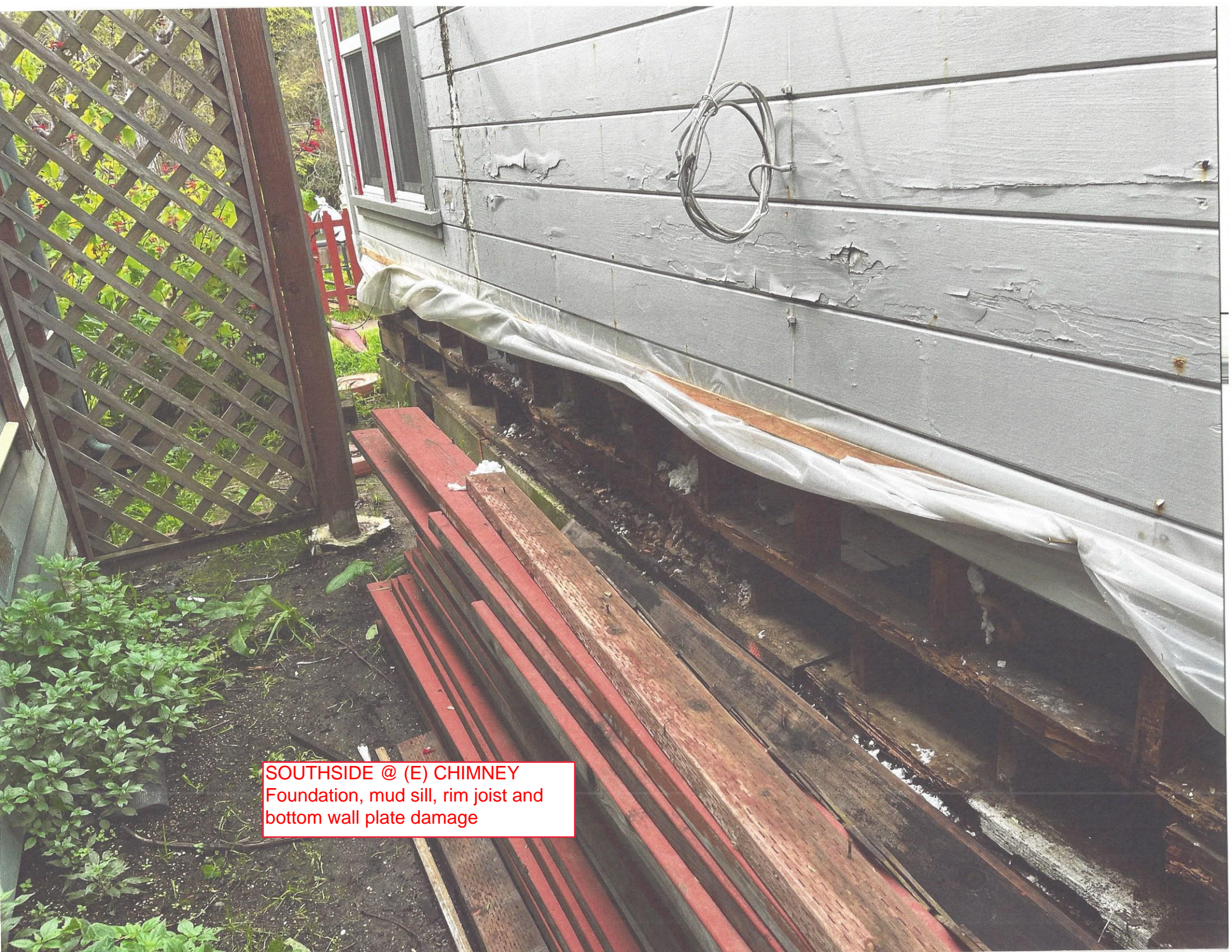
SOUTHSIDE @ (E) CHIMNEY Foundation, mud sill, rim joist and bottom wall plate damage