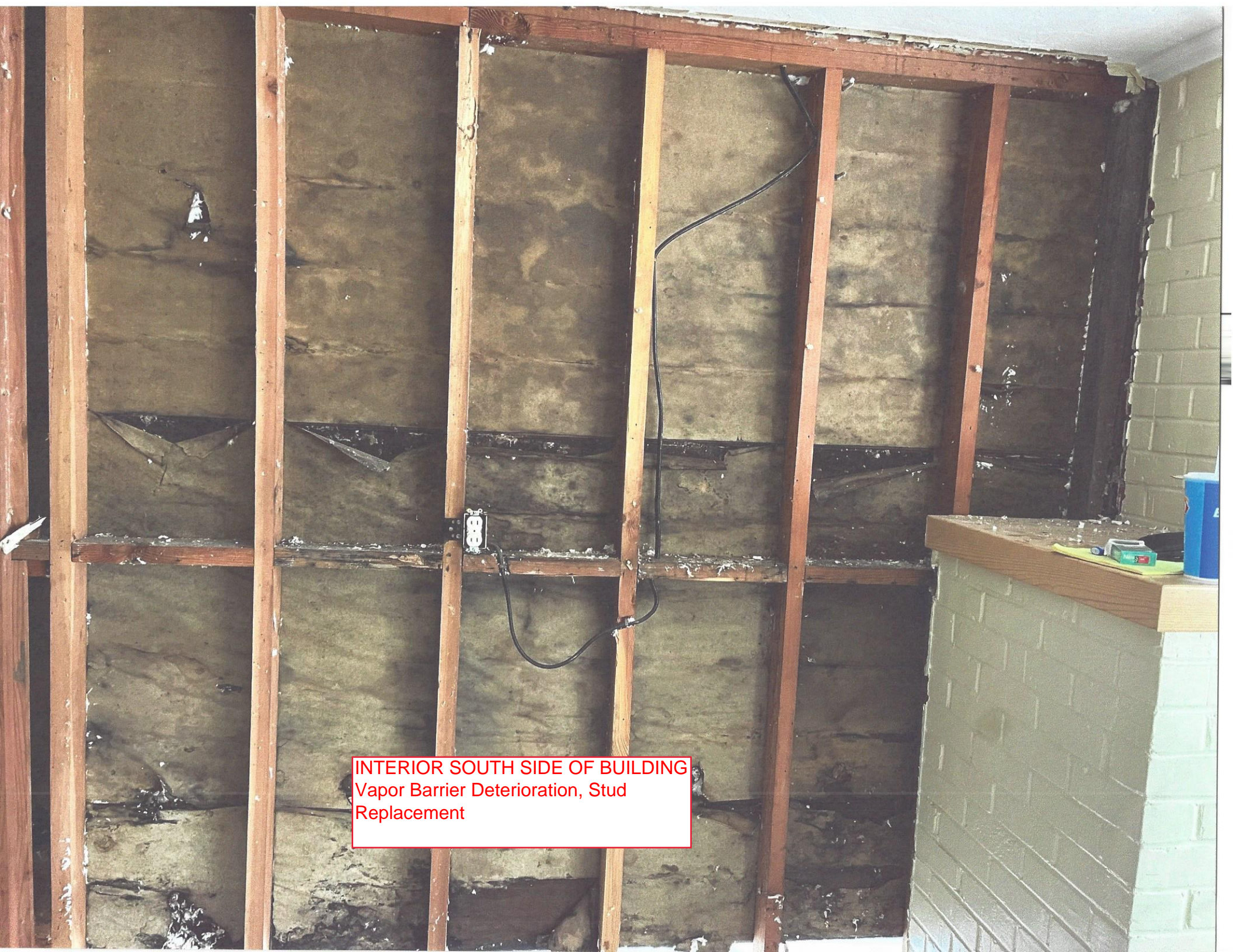
INTERIOR SOUTH SIDE OF BUILDING Vapor Barrier Deterioration, Stud Replacement