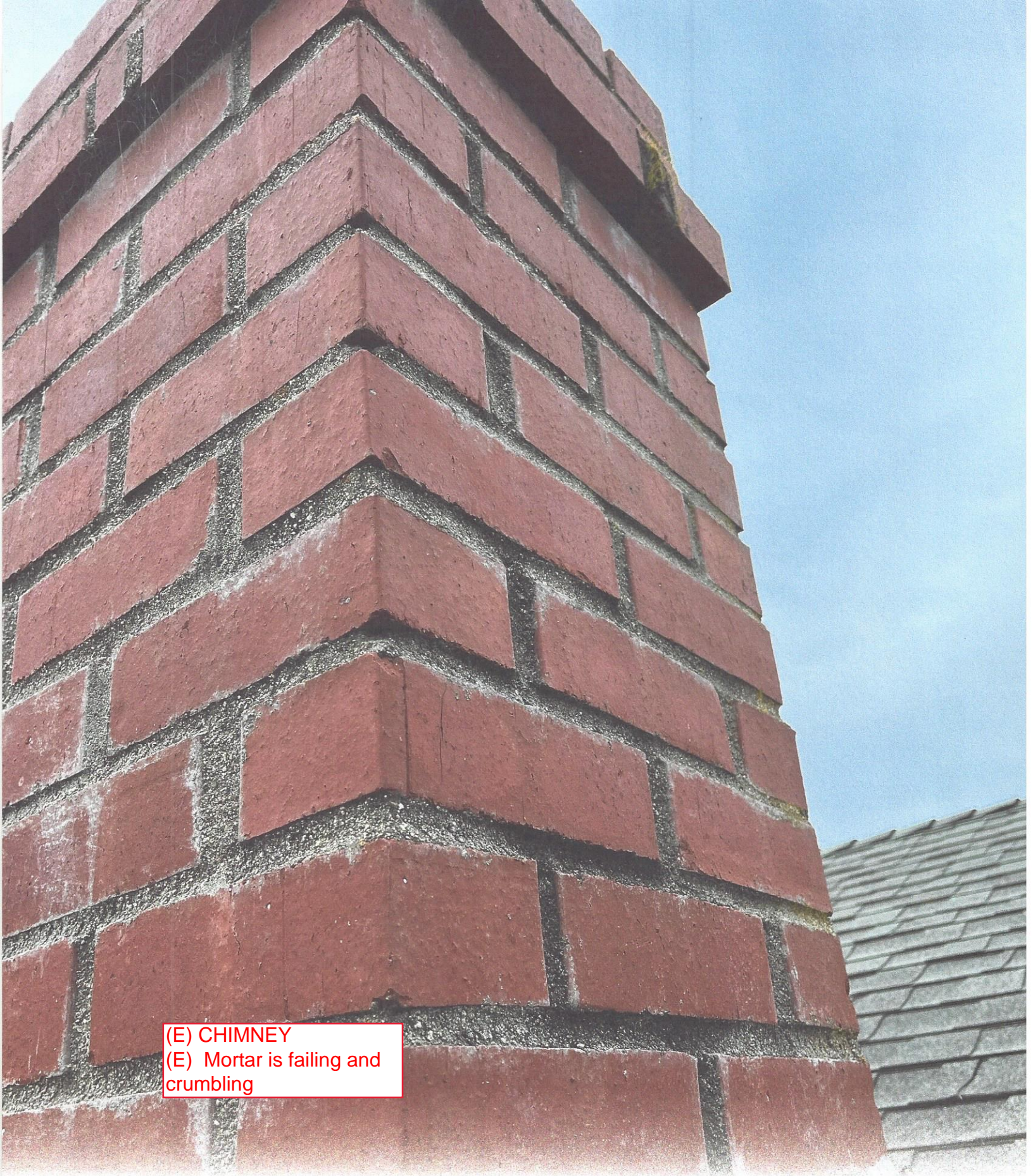
(E) CHIMNEY (E) Mortar is failing and crumbling