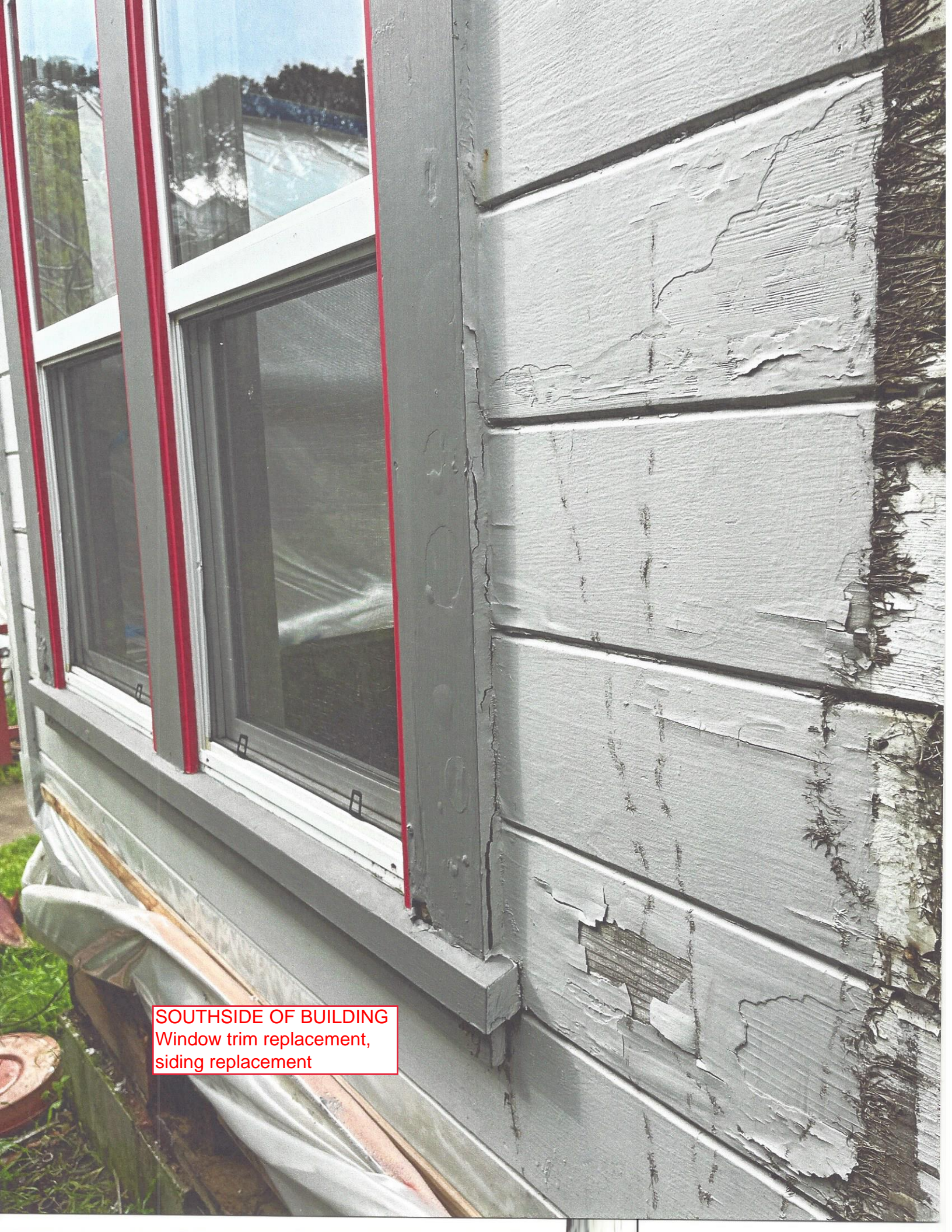
SOUTHSIDE OF BUILDING Window trim replacement, siding replacement