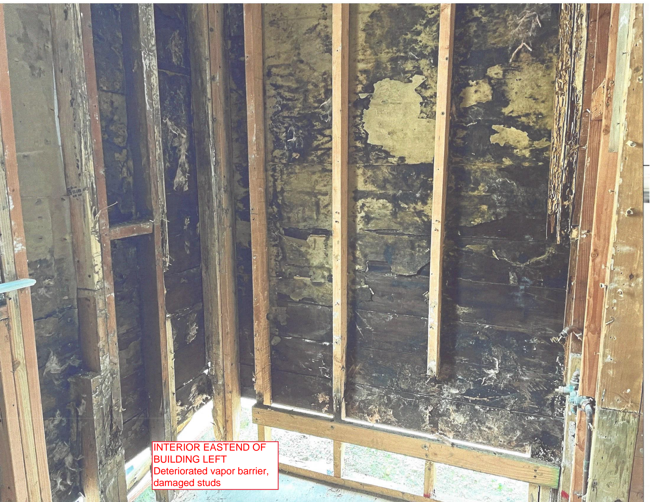
INTERIOR EASTEND OF BUILDING LEFT Deteriorated vapor barrier, damaged studs