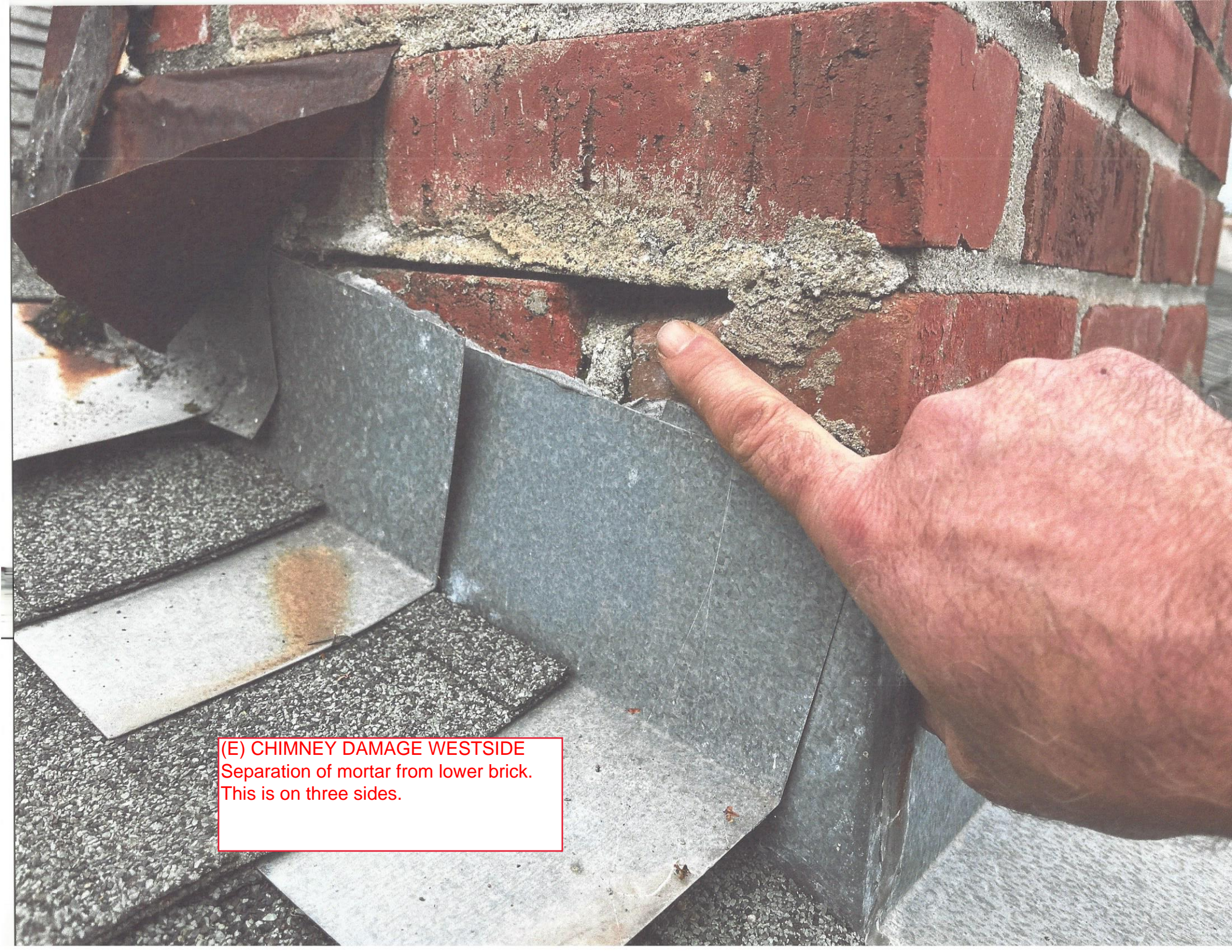
(E) CHIMNEY DAMAGE WESTSIDE Separation of mortar from lower brick. This is on three sides.