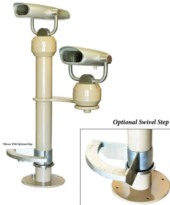
Figure 2. CWEP-Selected Viewing Stations