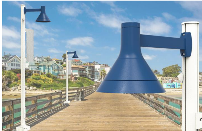
Figure 3. Rendering of CWEP-Selected Lighting Fixtures