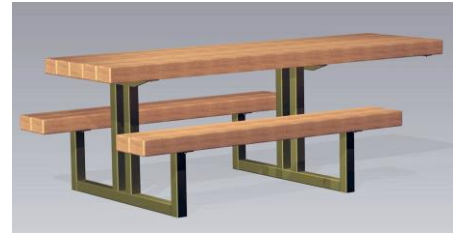
Figure 5. CWEP Selected Furnishings