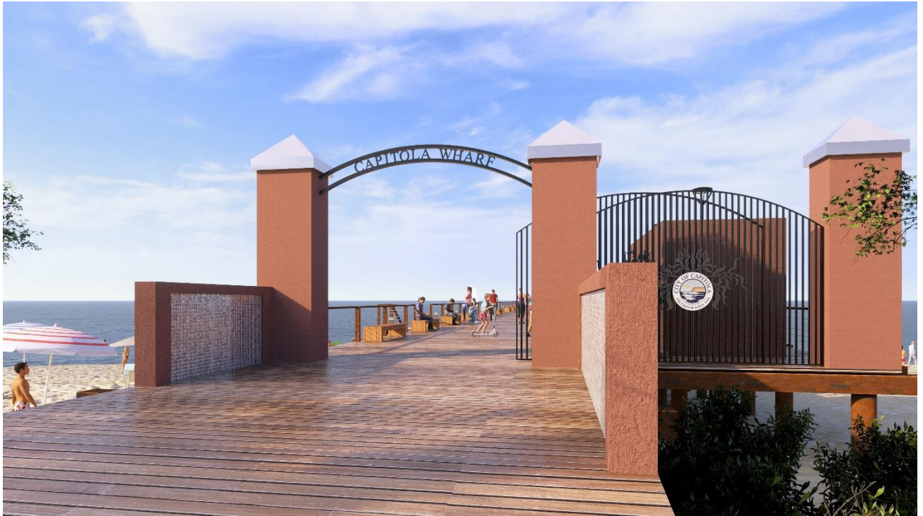
Figure 1. CWEP Entry Gate and Donor Wall Rendering

In the original Wharf Resiliency Project, the existing wharf entry gate was relocated approximately 15' inland, but not otherwise modified. The RRM design, included in Attachment 1, would have required the entry gate to be refabricated. The CWEP group has refined the RRM design and provided the updated rendering shown below. The updated design includes two wing walls with a donor acknowledgment art feature on the western side (listed as items B and F in the above table). The updated design includes illuminated glass tops; however, Capitola's Municipal Code prohibits lighting on the beach beyond the minimum necessary for public safety.