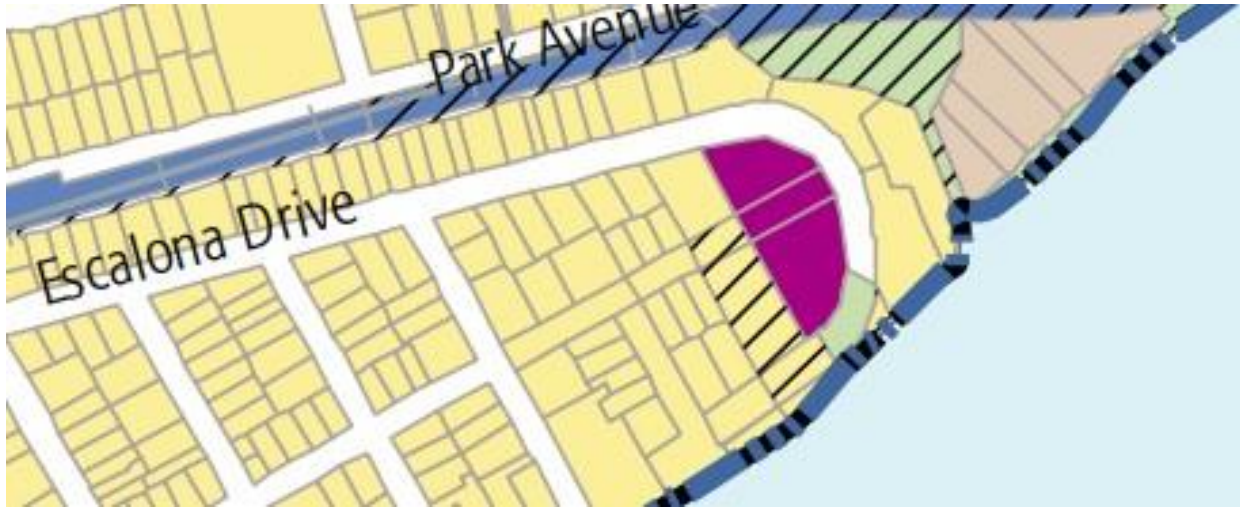
Existing General Plan Land Use Map