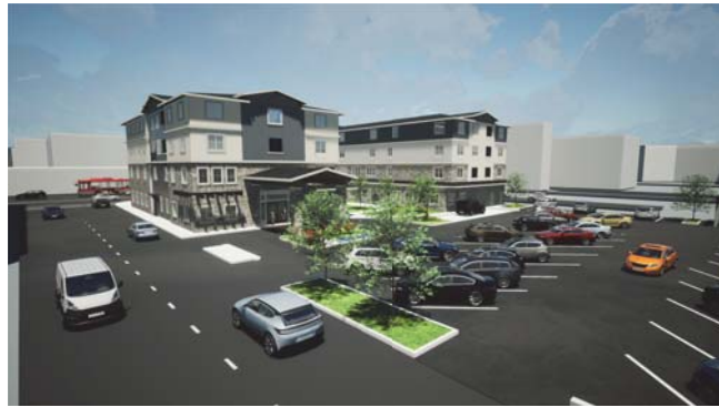
02 Building Entry Towards Capitola SCALE: 1/4" = 1'-0"