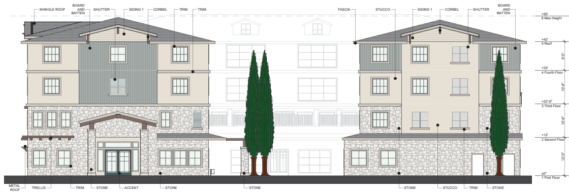
03 Front (North) Elevation SCALE: 1/8" = 1'-0"