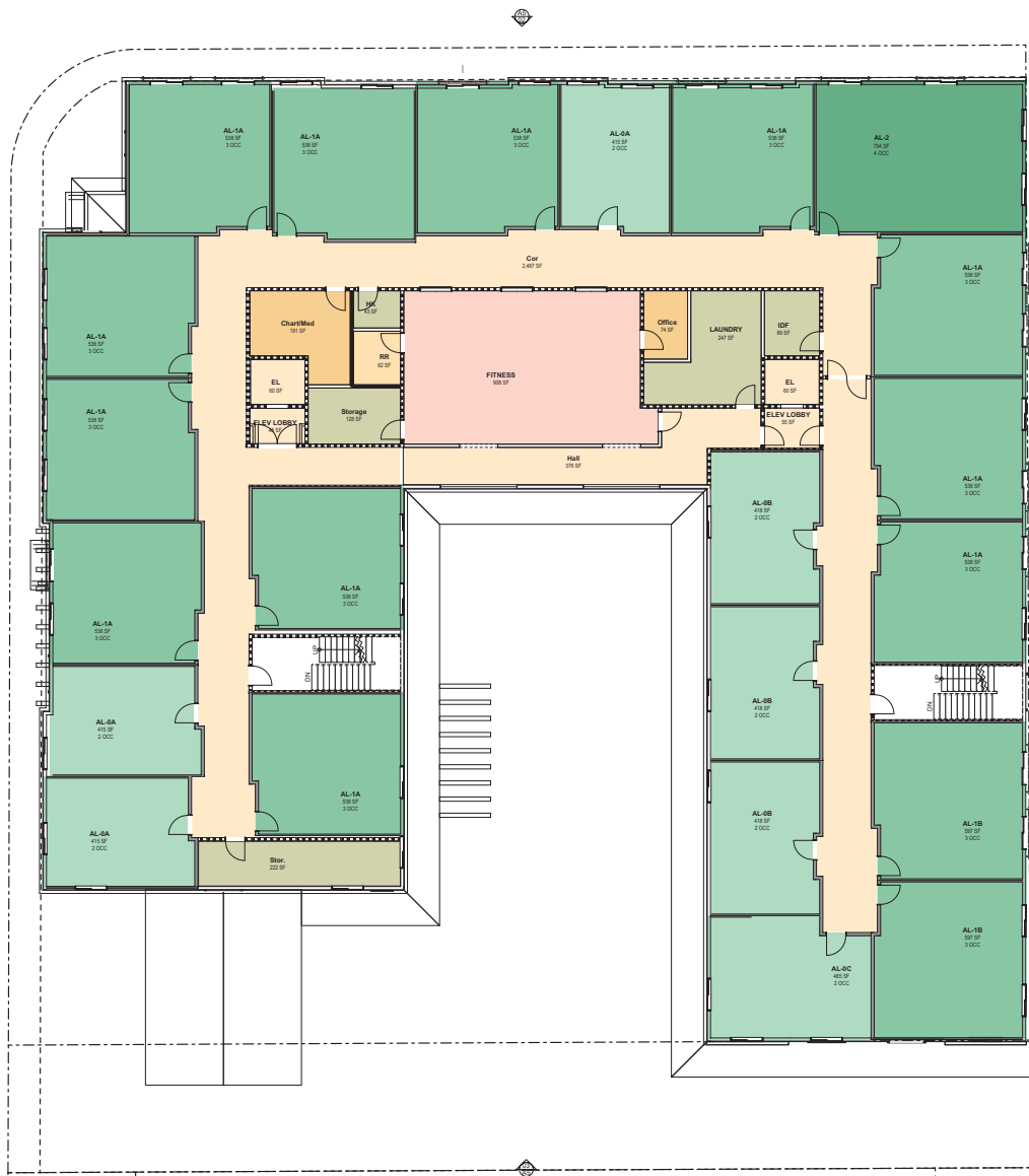
01 Third Floor SCALE: 1/8" = 1'-0"