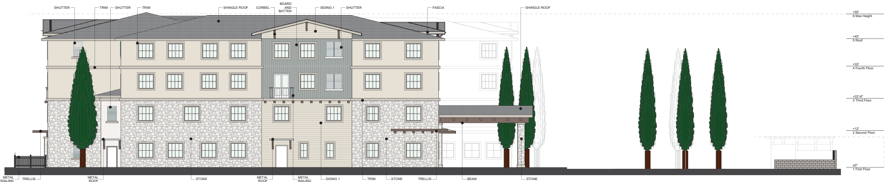
01 Side (East) Elevation SCALE: 1/8" = 1'-0"