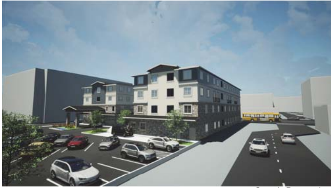
06 Generic Perspective SCALE: 1/4" = 1'-0"