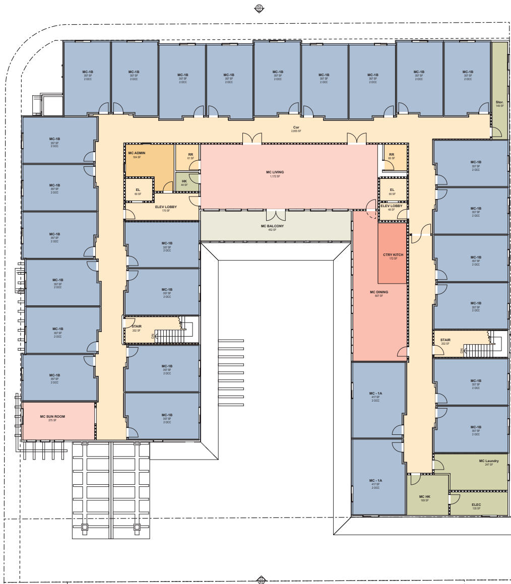
01 Second Floor Plan SCALE: 1/8" = 1'-0"