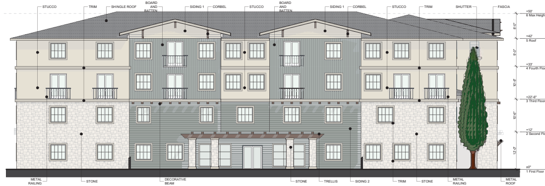
02 Back (South) Elevation SCALE: 1/8" = 1'-0"