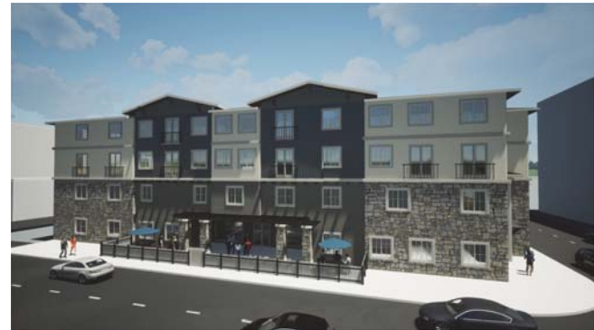
01 Corner SCALE: 1/4" = 1'-0"