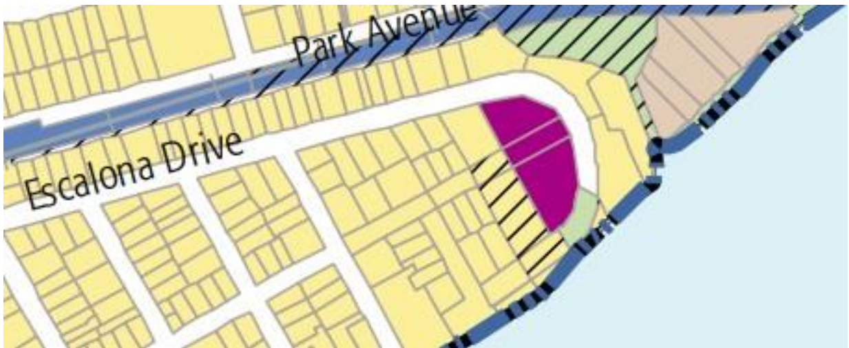
Existing Zoning Map