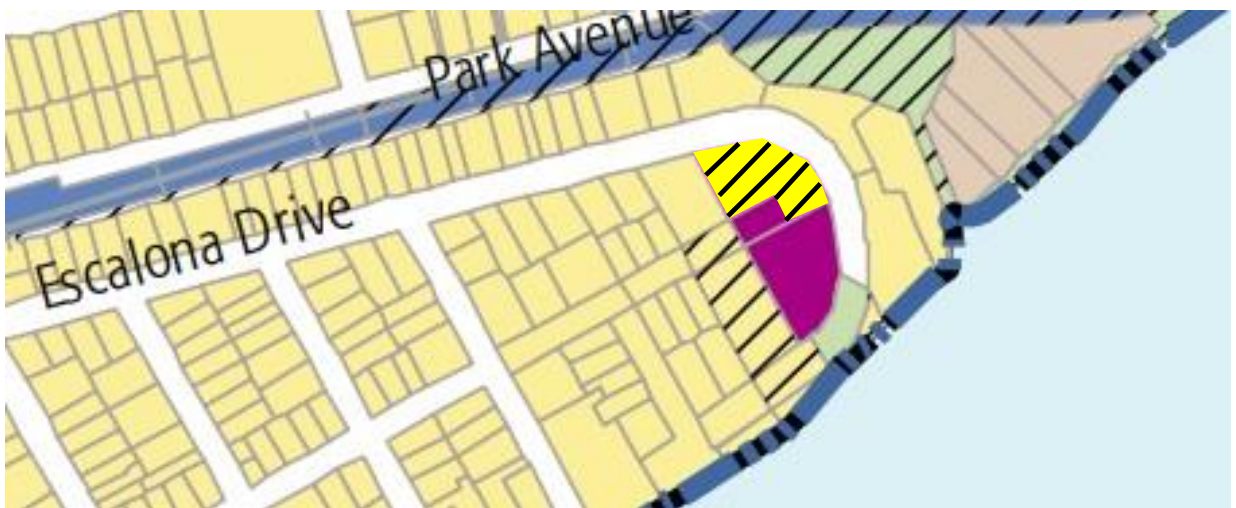
Proposed Zoning Map