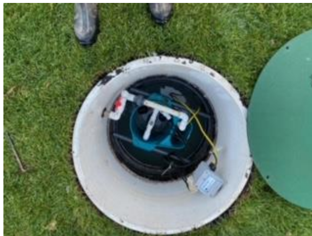
Figure 3: New Replaement Floats in STEP Tank

BENEFITS TO THE COMMUNITY: Smooth operation of STEP Tank pumping for the homeowner, and less call outs for city staff due to failures of the sensors in the existing tanks.