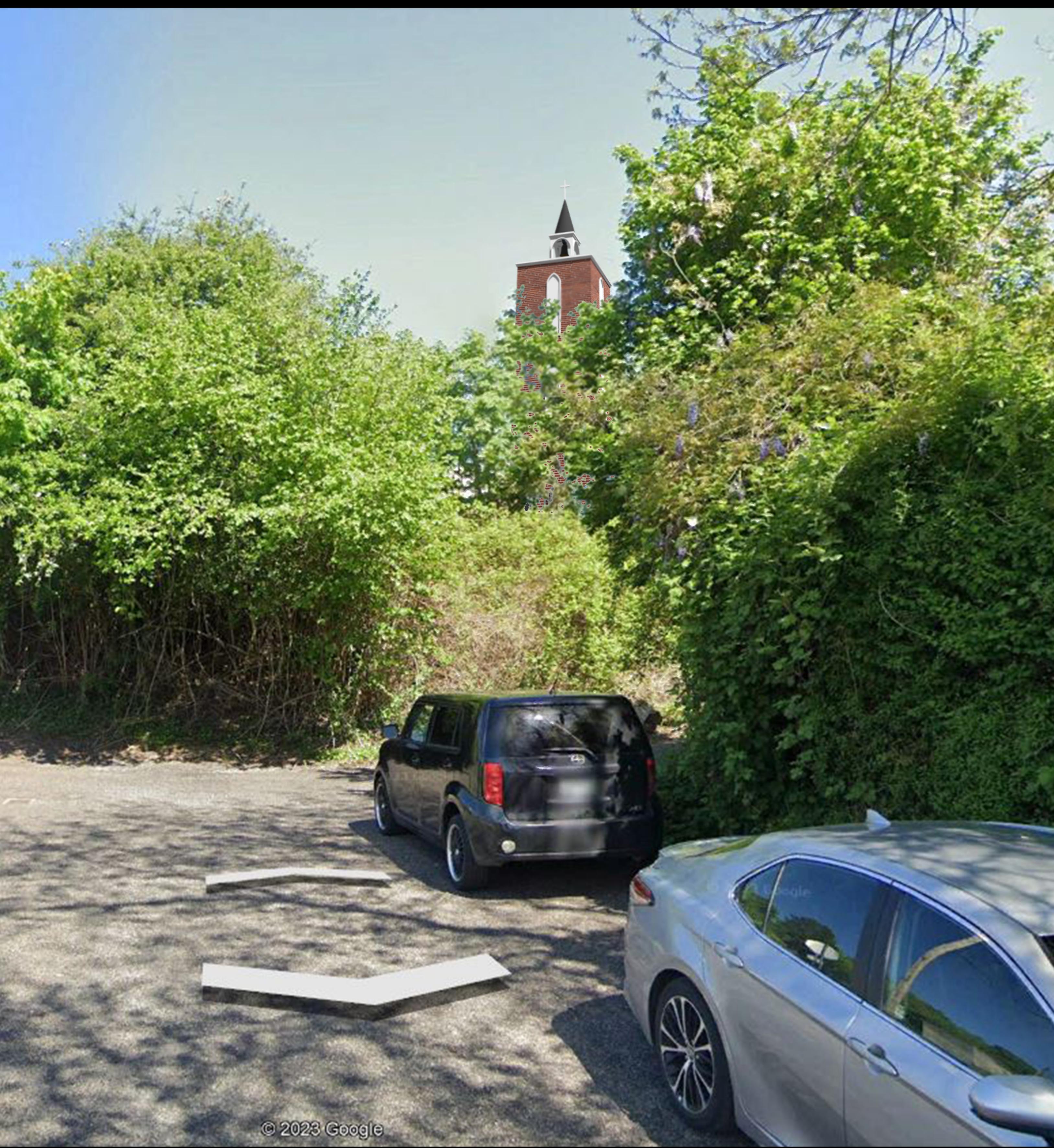
Existing Conditions - Looking North