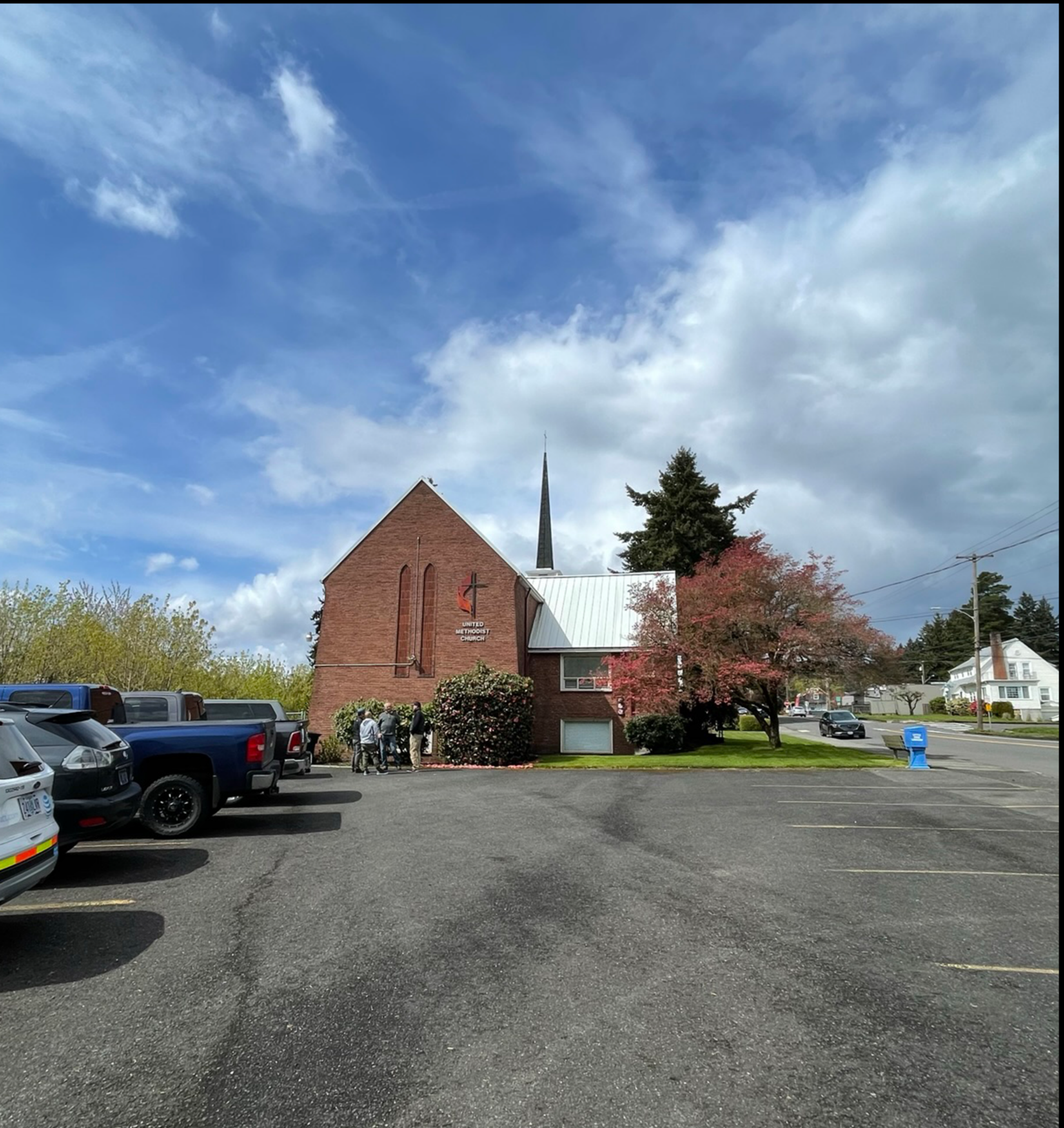
Exhibit 19 CUP23-03