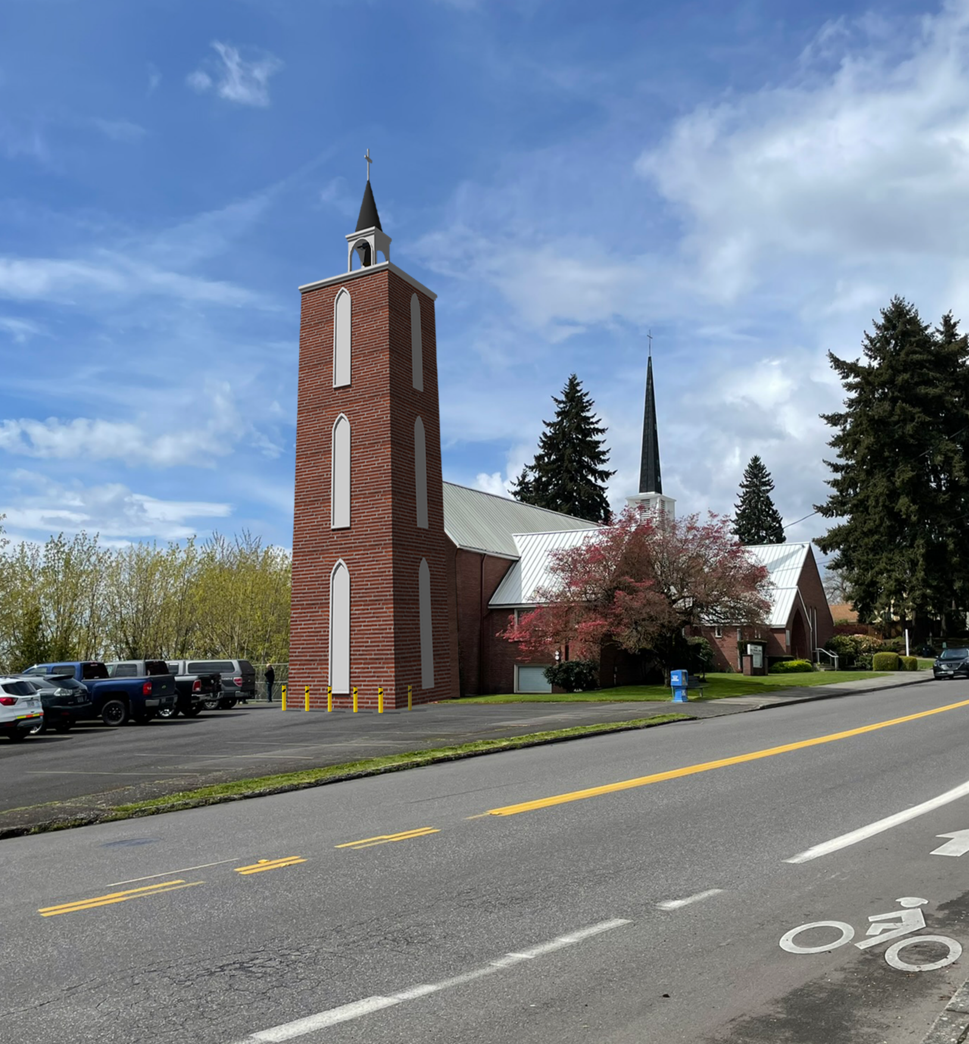
Existing Conditions - Looking Southwest