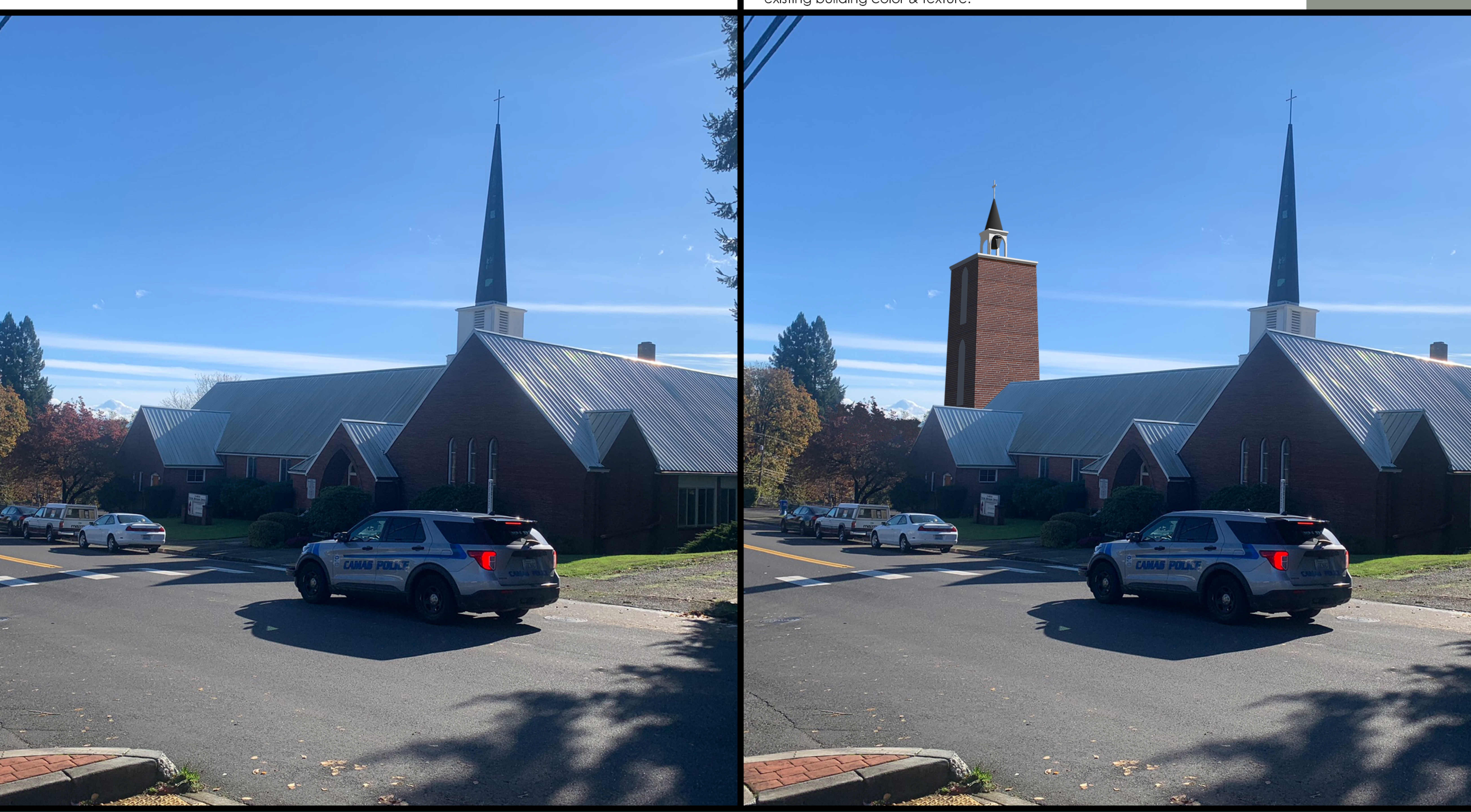
Exhibit 19 CUP23-03