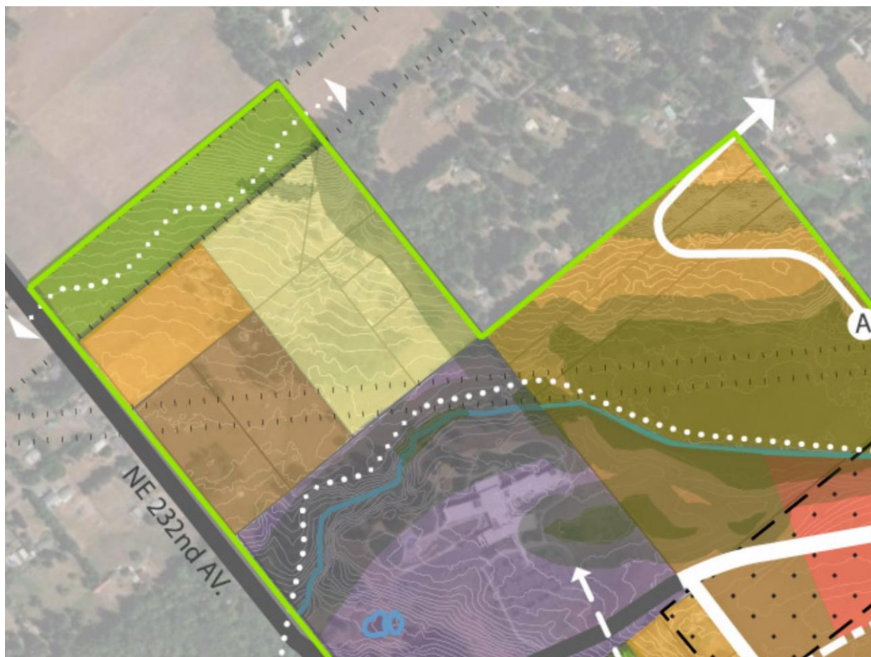
Figure 2 North Shore Plan