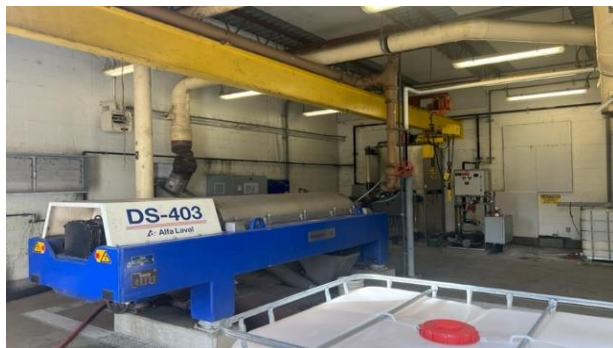
Fig.1 Centrifuge Room in Equipment bldg.

SUMMARY: HDR was selected through a Request for Qualifications (RFQ) process and the city is now working on the 4 th Task Order related to design work at the WWTP. The scope includes work to design a new UV system in the UV building, blower design for 2 of the 4 blowers, generator replacement and relocation, addition of a second centrifuge including structural modifications in that room,, new grit classifier equipment, septage receiving upgrades, and electrical upgrades for all these components. HVAC upgrades in the equipment building will allow a second centrifuge to be placed in the space, allow additional air exchanges in the grit room, plus help cool electrical equipment in electrical room.