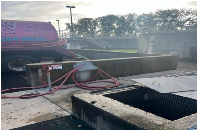
Fig 5 Septage Receiving Station