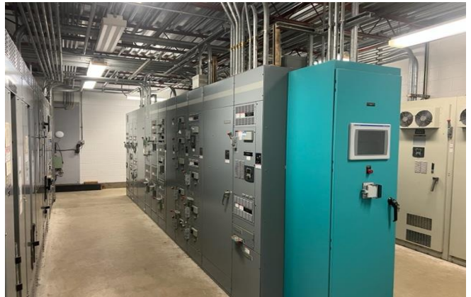
Fig. 6 Electrical Room HVAC upgrades