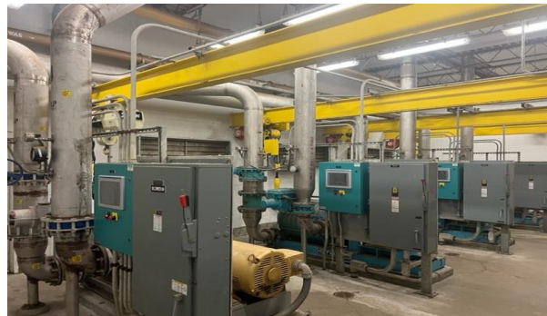
Fig.2 Blower Room