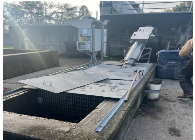
Fig. 8 Septage Receiving Station