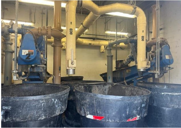
Fig.3 Grit Removal Room