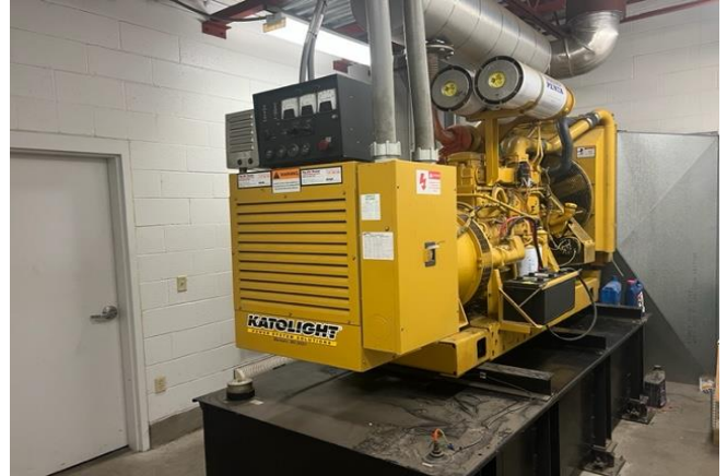
Fig. 4 Generator