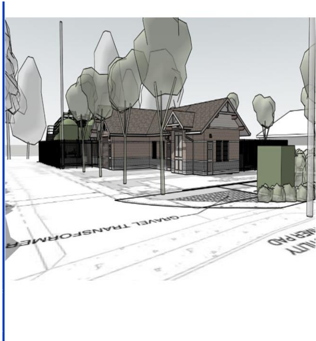
Figure 4: Rendering of Street View