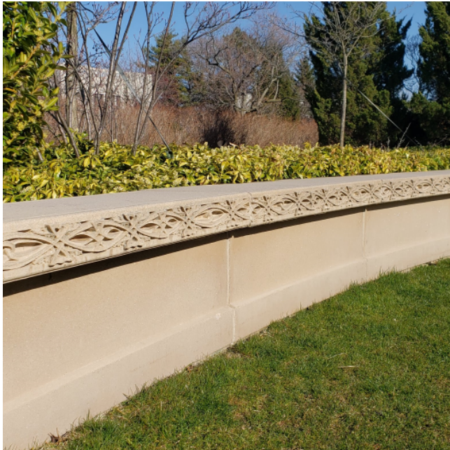
PLANTER WALL CAST STONE DETAILS CAMAS MOTIF