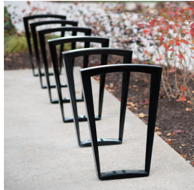
EMERSON BIKE RACK LANDSCAPE FORMS BLACK POWDERCOAT