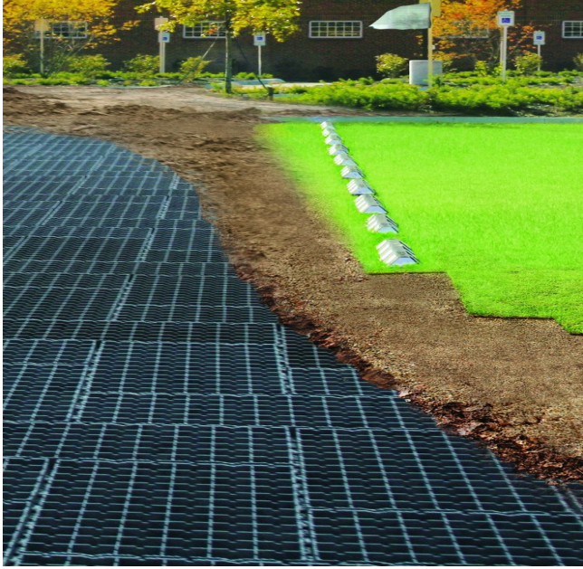
VEHICULAR GRASS PAVE: PRESTO GEOSYSTEMS GEOBLOCK POROUS PAVEMENT SYSTEM