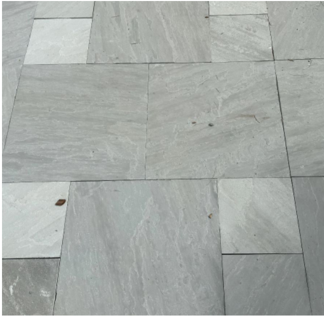
STONE PAVERS MATCH BUILDING FACADE GRANITE