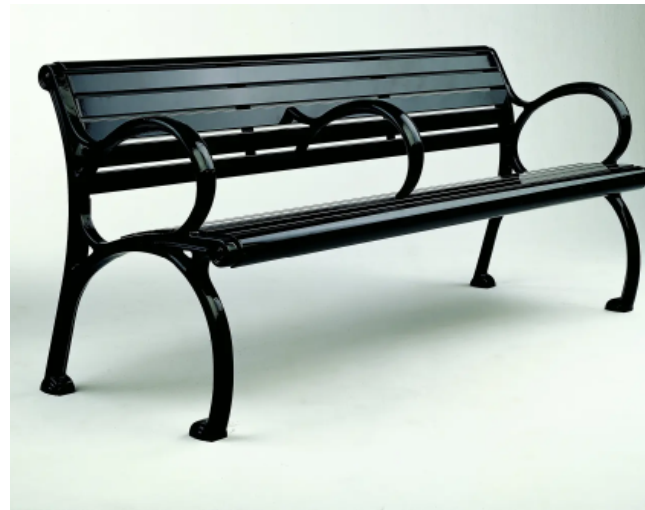
PLAINWELL STEEL BENCH LANDSCAPE FORMS BLACK POWDERCOAT