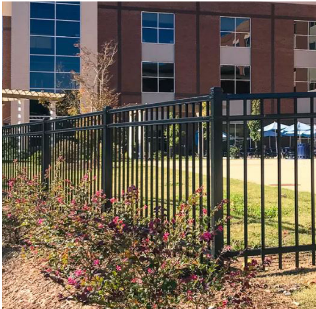
MONTAGE PLUS MAJESTIC FENCE AMERISTAR POWDERCOATED STEEL, BLACK