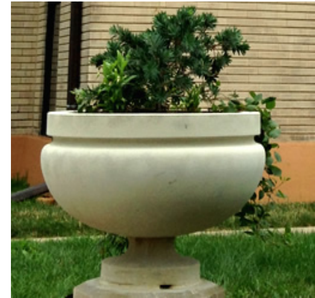
PAVILION PLANTER LONGSHADOW CAST STONE