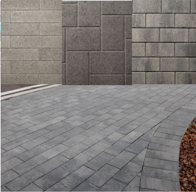
PRECAST CONCRETE PAVERS: BELGARD DIMENSIONS COLORS: RIO, CHARCOAL, AND GREY