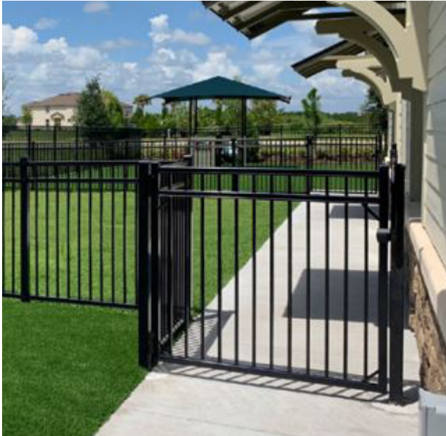
ORNAMENTAL SINGLE SWING GATE AMERISTAR POWDERCOATED STEEL, BLACK, 6' HEIGHT