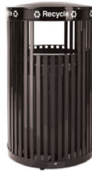
SDC-45 RECEPTACLE VICTOR STANLEY BLACK POWDERCOAT