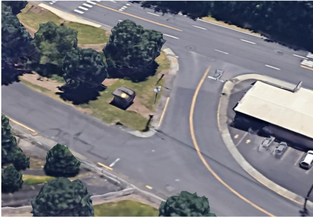
Fig 1: Ex. Forrest Home Booster Station(Drake/ NW 6th Ave)