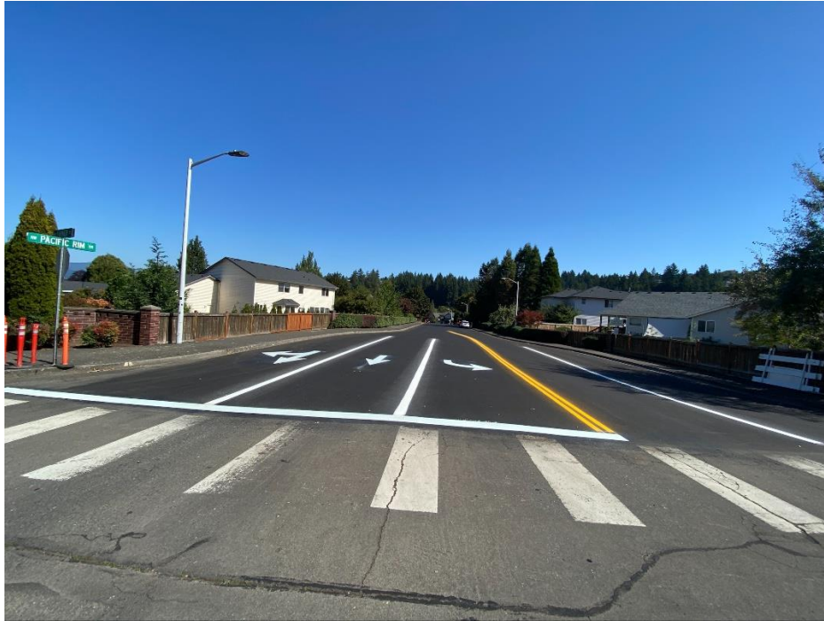
New Wearing Surface placed in Two Lifts

NW Pacific Rim Drive from NW Parker to NW 27 th AVE.