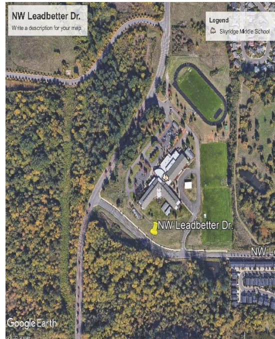
Figure 2: NW Leadbetter Drive Road Improvement