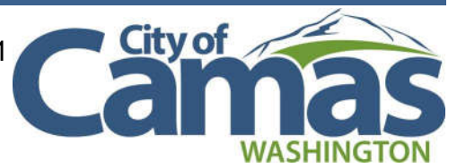
Exhibit 23 LI/BP21-01

A public meeting of the Design Review Committee will be held on April 14, 2022 , beginning at 5:00 p.m., via Zoom. All citizens are entitled to have equal access to the services, benefits and programs of the City of Camas. Please contact the City Clerk at (360) 817-1591 for special accommodations if needed. The City will provide translators for non-English speaking persons who request assistance at least three working days prior to a public meeting.