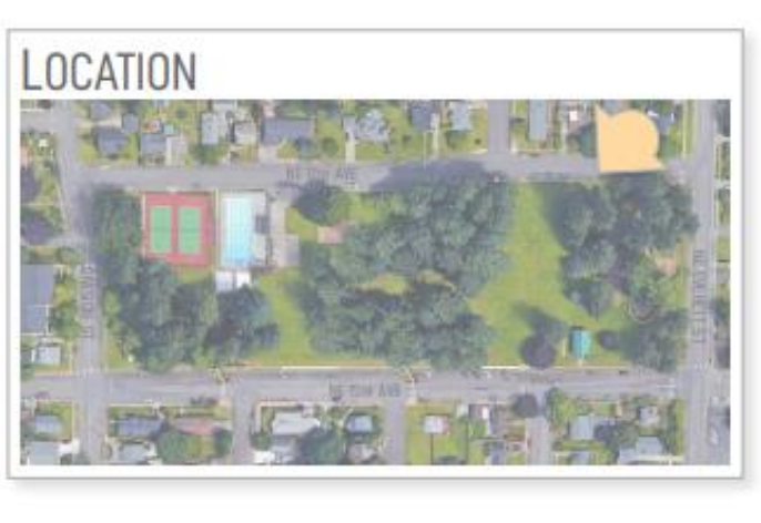
GEORGIA-PACIFIC WWII MEMORIAL RELOCATION OPTION B