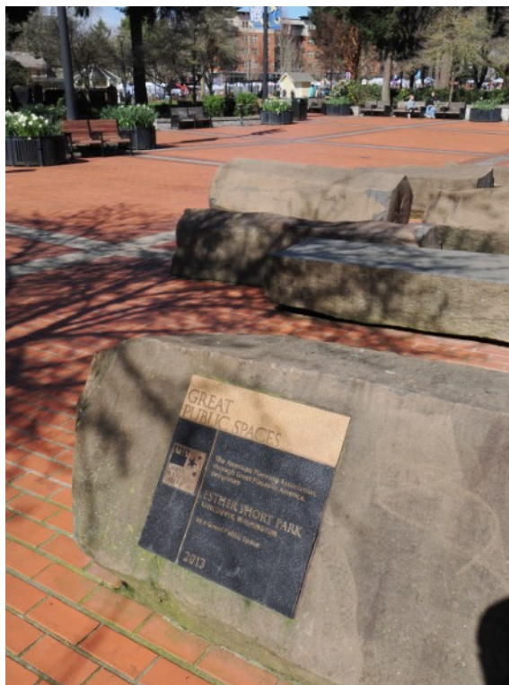
Here are sample photos of a traditional bench, a bench with a small plaque, the Lacamas Heritage Trail plaque and the start of the Lacamas Heritage Trail, plus a basalt bench with plaque in Esther Short Park in Vancouver.