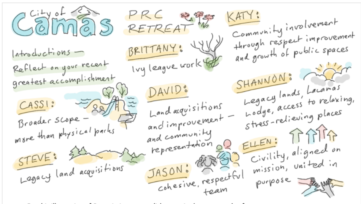
Graphic illustration of Commission accomplishments in the past couple of years

Due to the COVID-19 pandemic, the Parks & Recreation Commission (Commission) did not present a 2020 annual report to City Council. Though 2021 continued to be disrupted by the pandemic, the Commission continued their work via virtual meetings. Per Camas Municipal Code, Chapter 2.28.060 – Annual Report, we are please to present this report which provides a snapshot of the Commission’s and the Parks & Recreation Department’s work in 2021 and highlights of accomplishments in 2020.