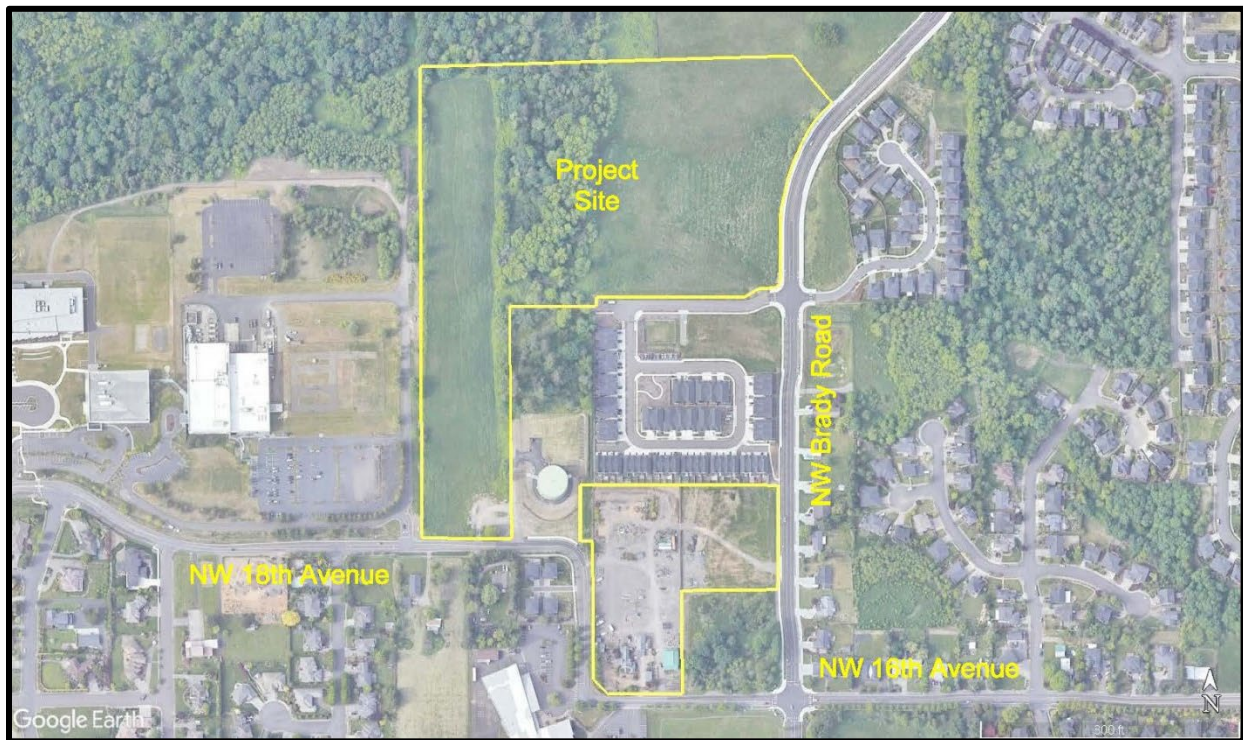
Figure 1: Aerial Photo of Site Vicinity