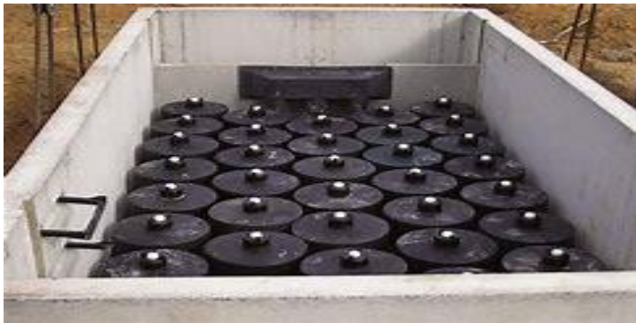
Figure 2: Storm filter vaults example

RECOMMENDATION. Staff recommends that this item be placed on the April 15 th , 2024 regular meeting consent agenda for council's consideration.