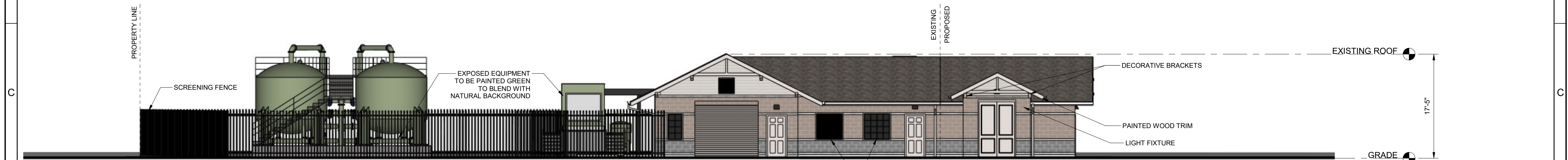
2 EAST ELEVATION - STAGE 1 SCALE: 1/8" = 1'-0"