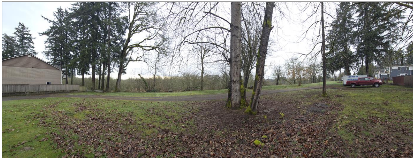
Facing South of the Site