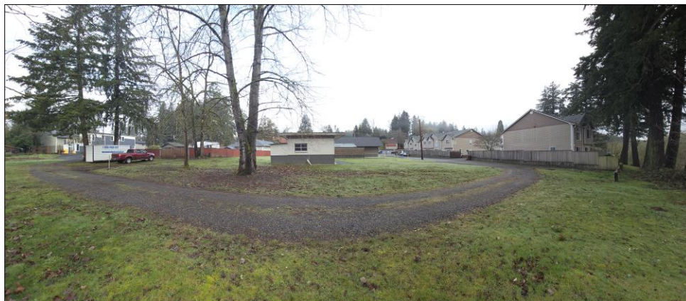
Facing North Into the Site