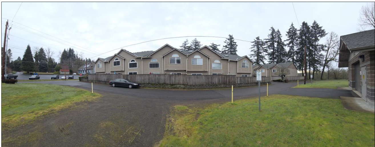
Facing East of the Site