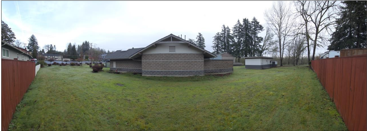
Facing East Into the Site