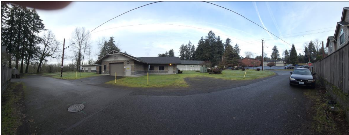
Facing West Into the Site