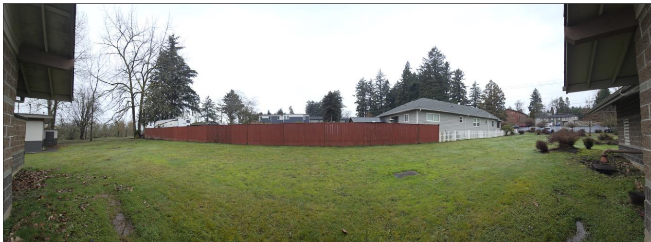
Facing West of the Site