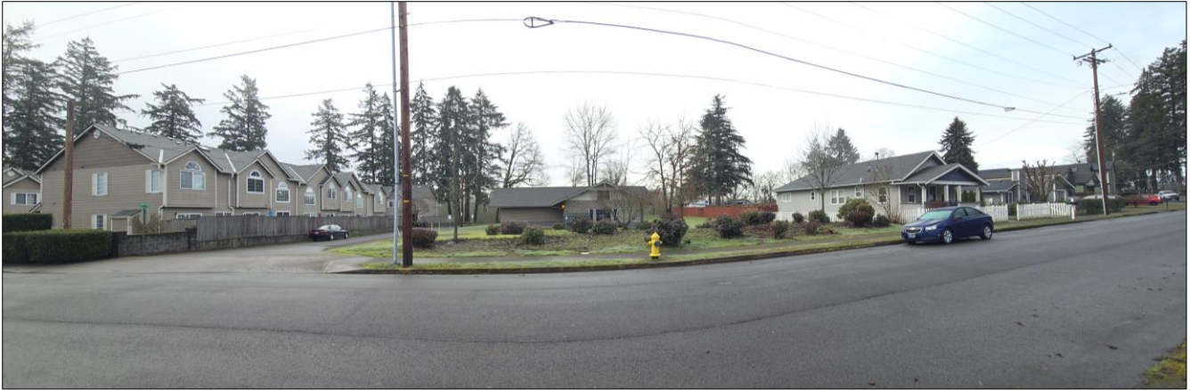
Facing South into the Site