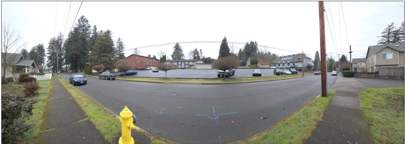
Facing North of the Site