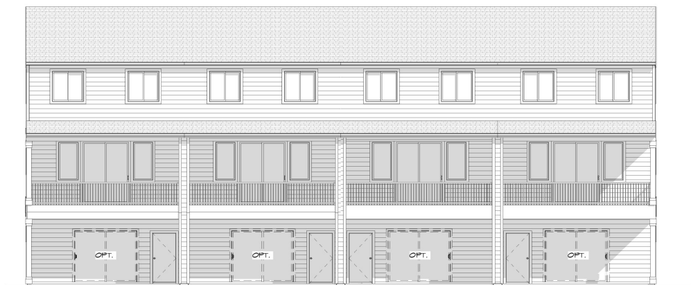
REAR ELEVATION 1/8" = 1'-0"