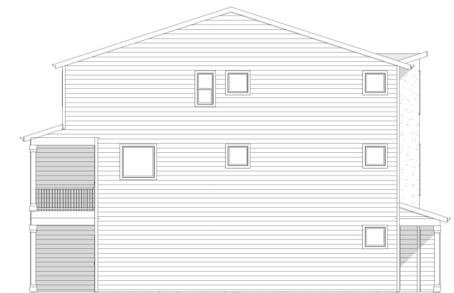
LEFT ELEVATION 1/8" = 1'-0"