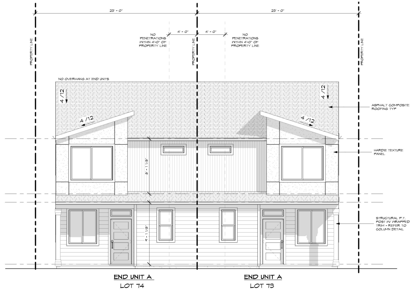
FRONT ELEVATION 1/4" = 1'-0"