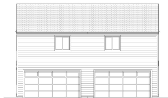
REAR ELEVATION 1/8" = 1'-0"