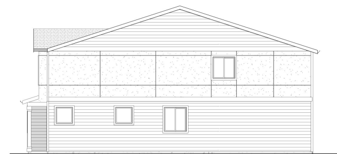
RIGHT ELEVATION 1/8" = 1'-0"