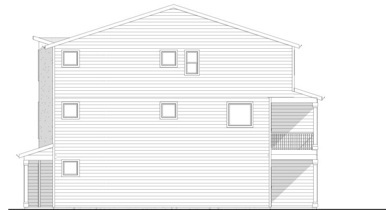
RIGHT ELEVATION 1/8" = 1'-0"