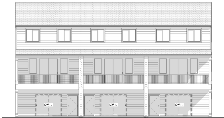
REAR ELEVATION 1/8" = 1'-0"