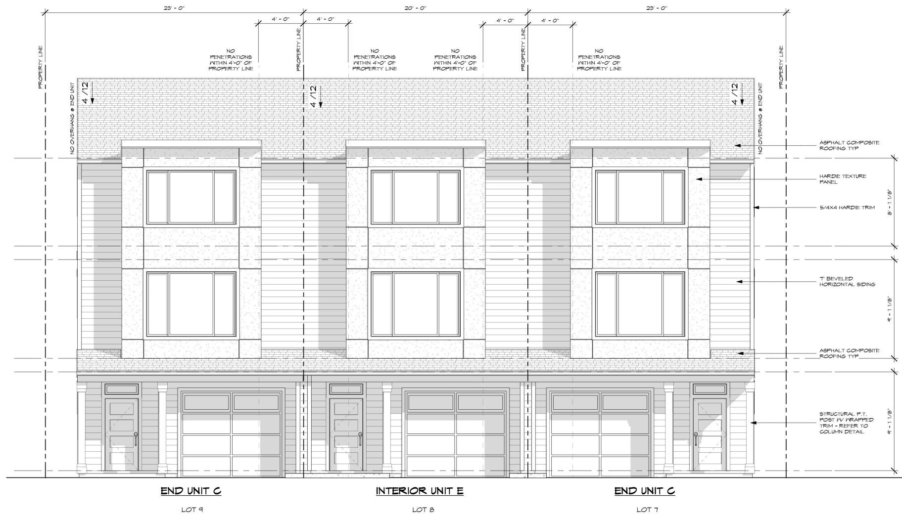
FRONT ELEVATION 1/4" = 1'-0"