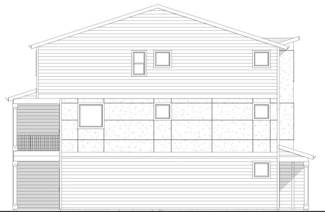
LEFT ELEVATION 1/8" = 1'-0"