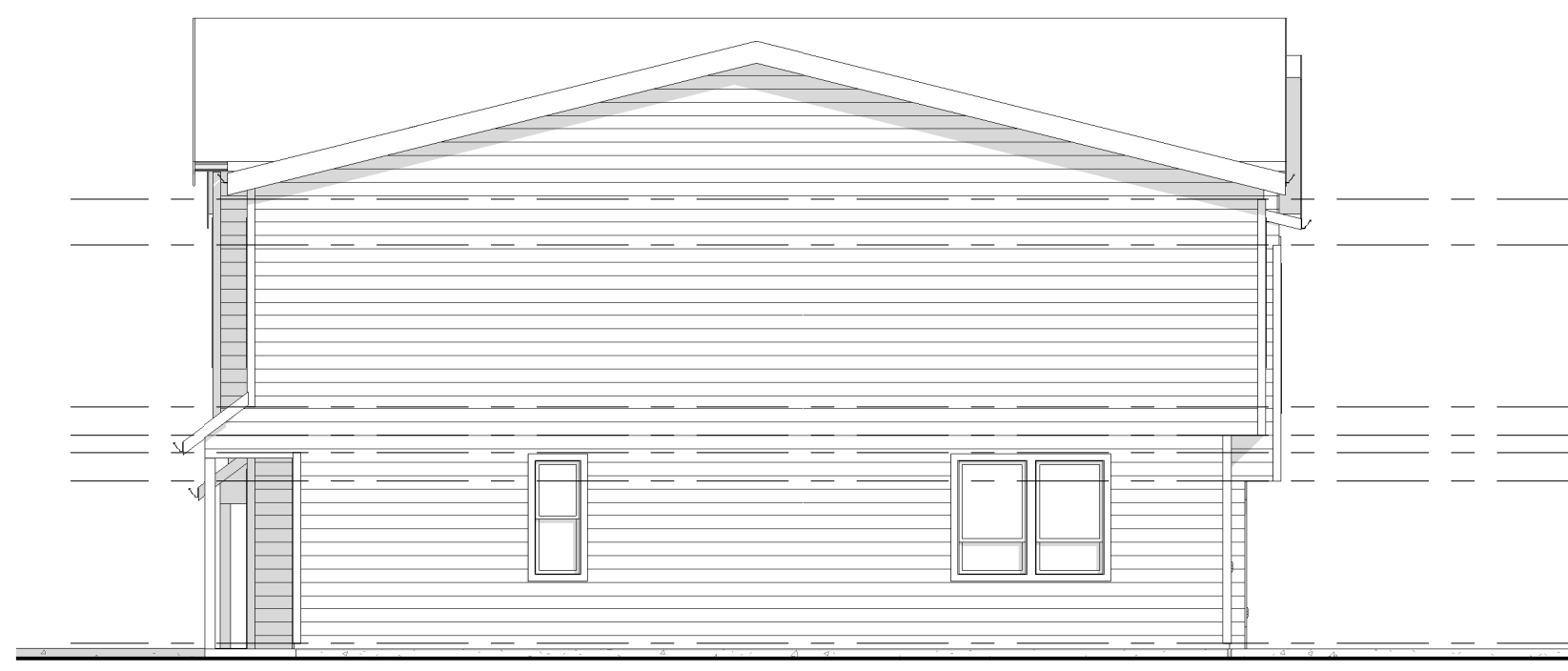
LEFT ELEVATION 1/8" = 1'-0"