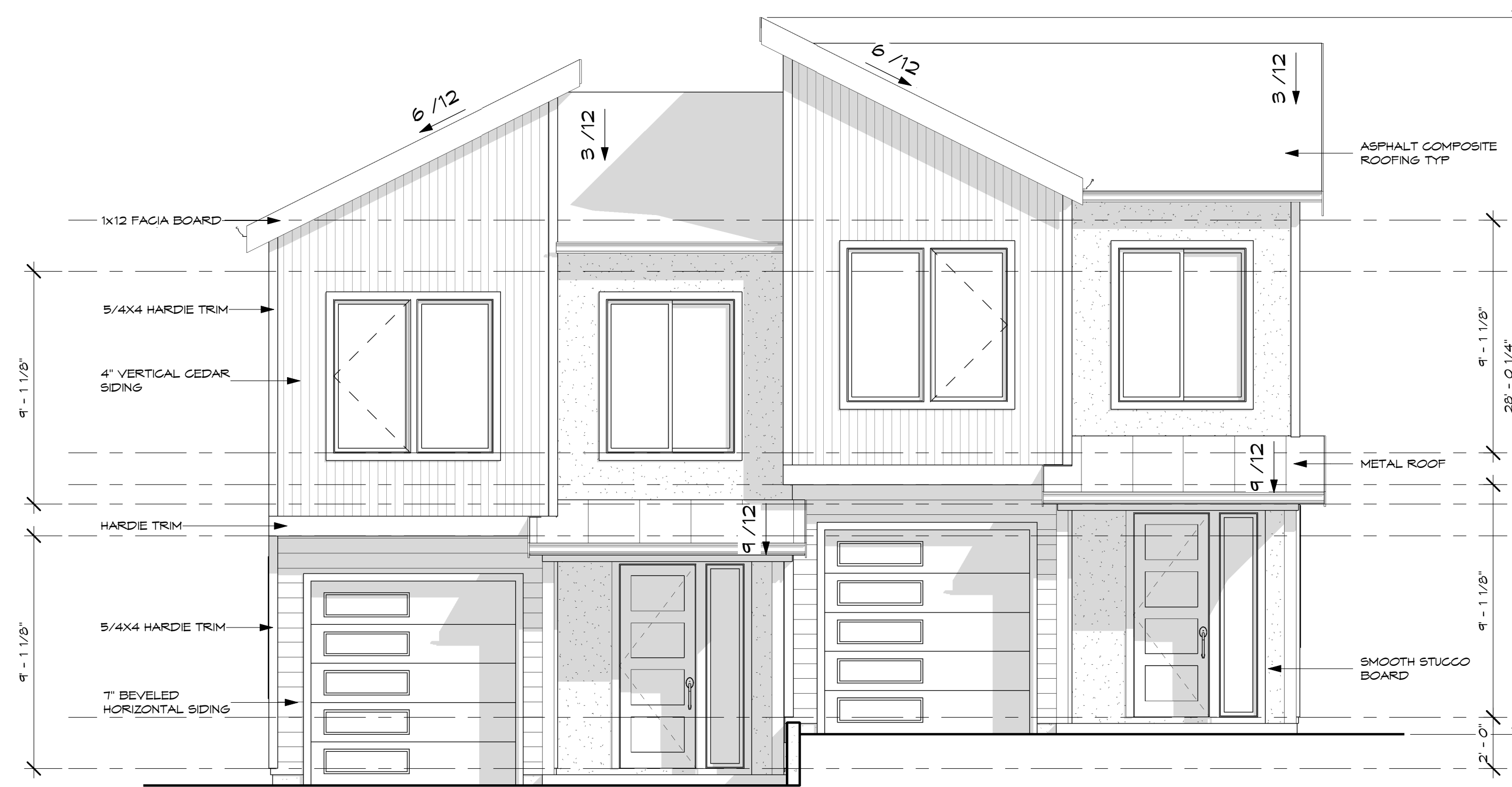
FRONT ELEVATION 1/4" = 1'-0"