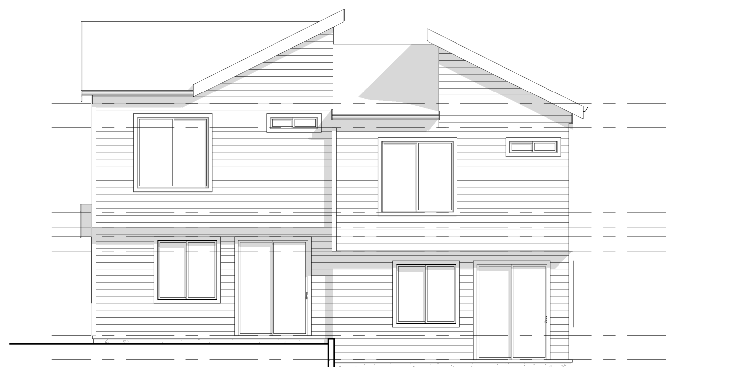
REAR ELEVATION 1/8" = 1'-0"