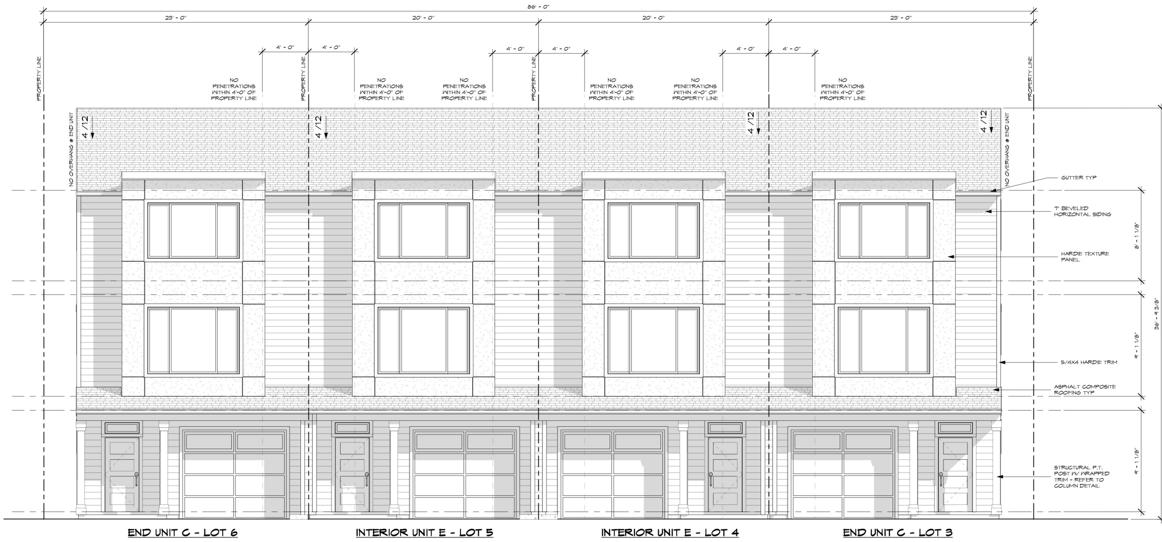
FRONT ELEVATION 1/4" = 1'-0"