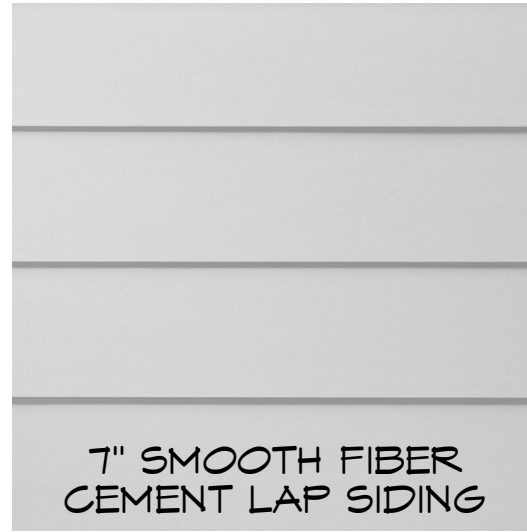
7" SMOOTH FIBER CEMENT LAP SIDING