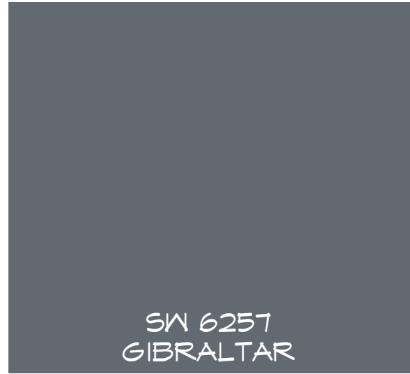
SW 6257 GIBRALTAR