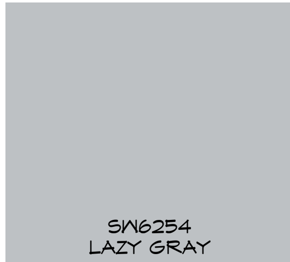
SW6254 LAZY GRAY