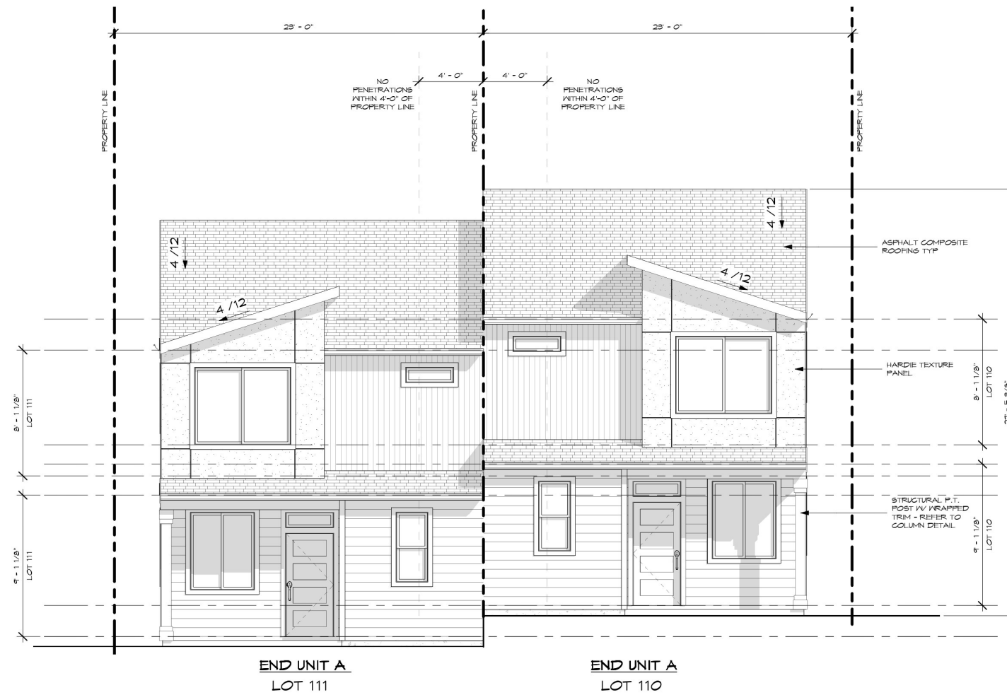
FRONT ELEVATION 1/4" = 1'-0"