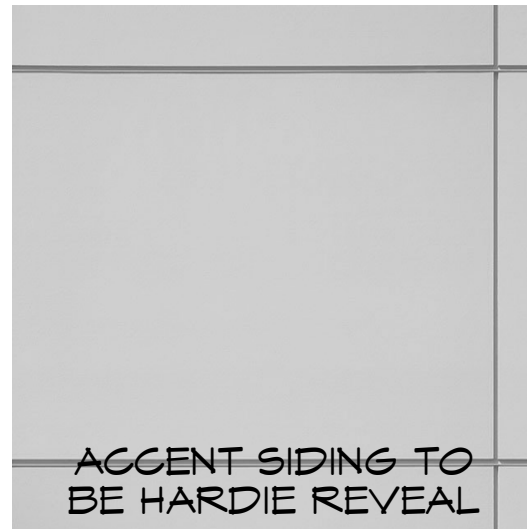
ACCENT SIDING TO BE HARDIE REVEAL