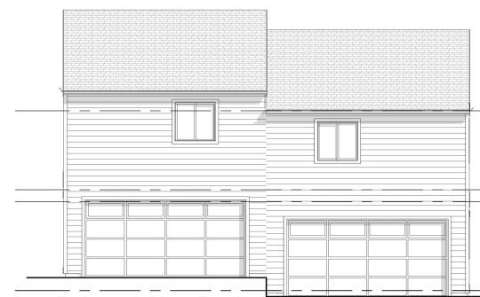
REAR ELEVATION 1/8" = 1'-0"