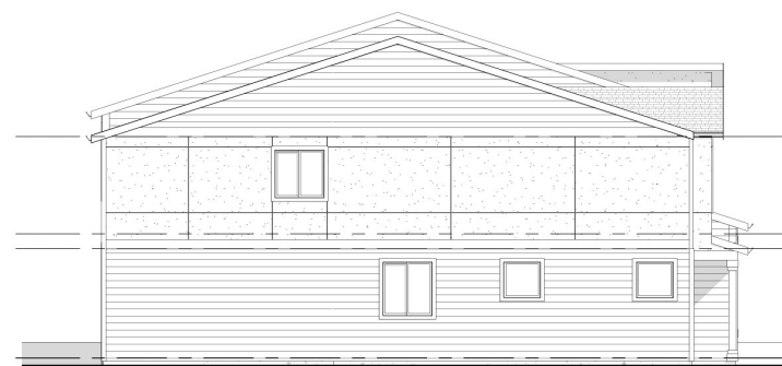
LEFT ELEVATION 1/8" = 1'-0"