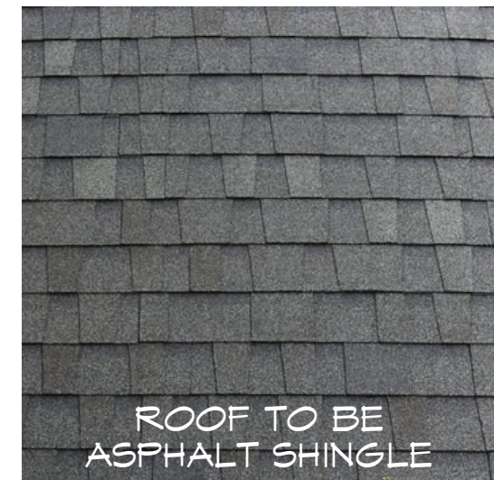
ROOF TO BE ASPHALT SHINGLE