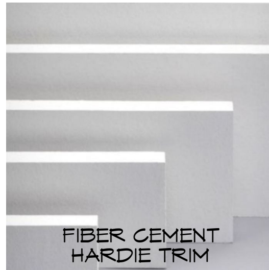
FIBER CEMENT HARDIE TRIM