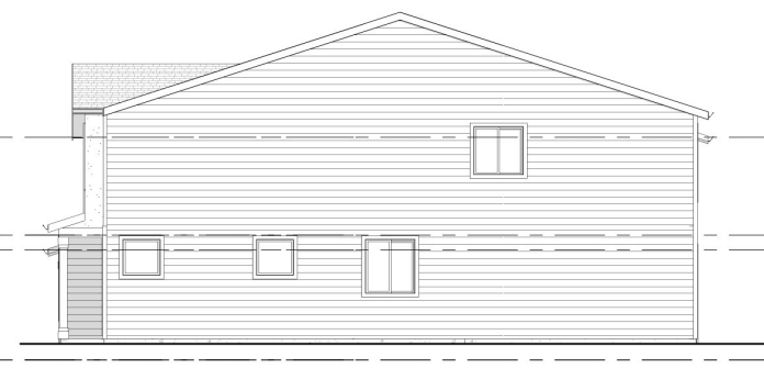
RIGHT ELEVATION 1/8" = 1'-0"