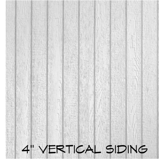
4" VERTICAL SIDING