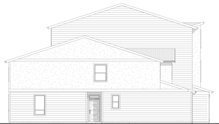
LEFT ELEVATION 1/8" = 1'-0"