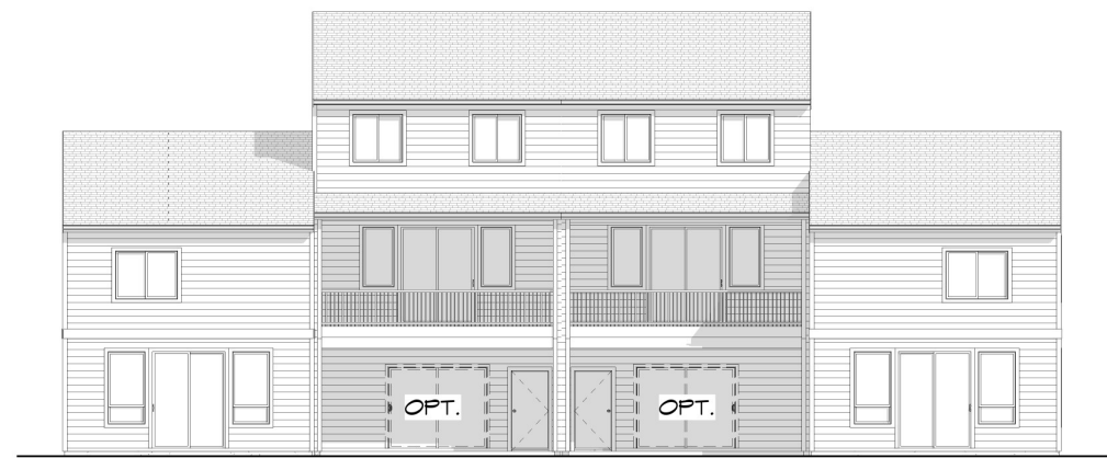
REAR ELEVATION 1/8" = 1'-0"