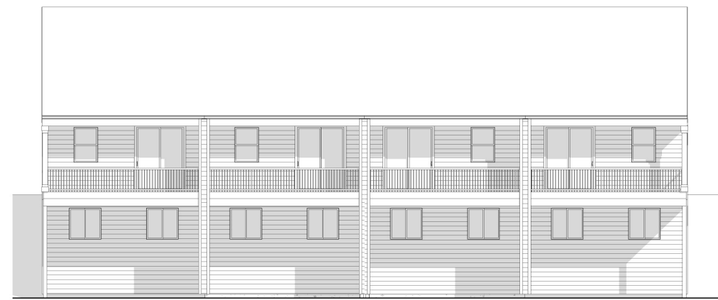
REAR ELEVATION 1/8" = 1'-0"