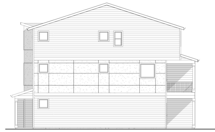
RIGHT ELEVATION 1/8" = 1'-0"