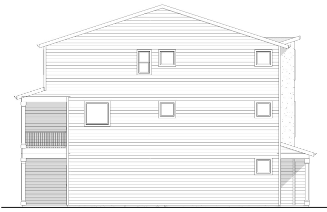
LEFT ELEVATION 1/8" = 1'-0"