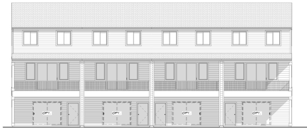
REAR ELEVATION 1/8" = 1'-0"