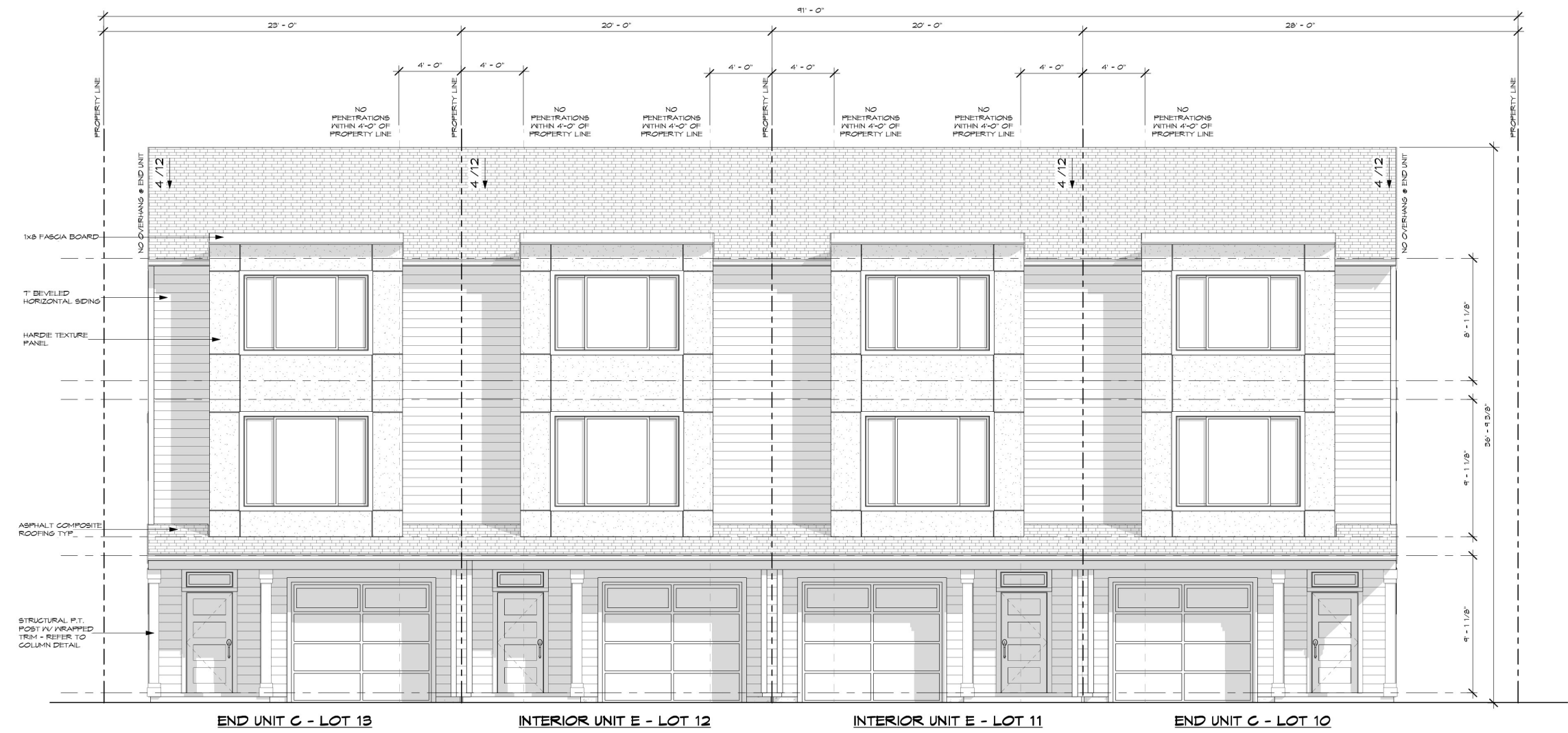
FRONT ELEVATION 1/4" = 1'-0"