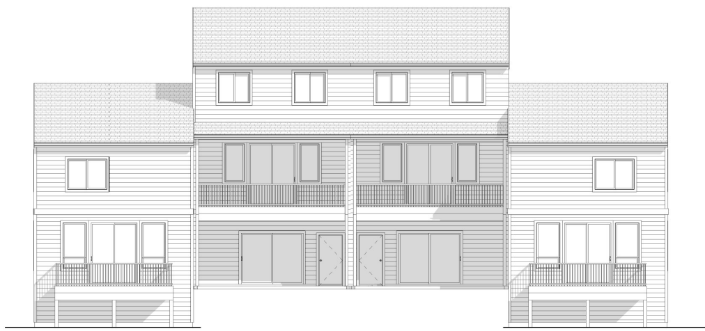
REAR ELEVATION 1/8" = 1'-0"