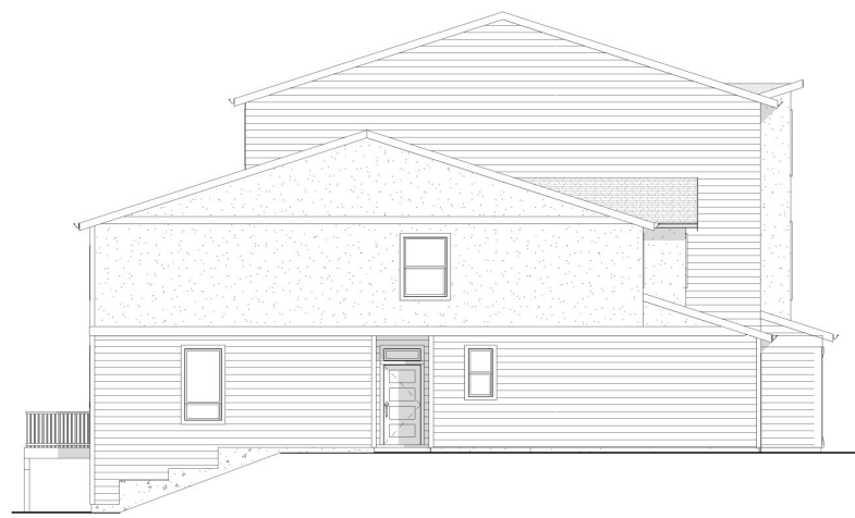
LEFT ELEVATION 1/8" = 1'-0"