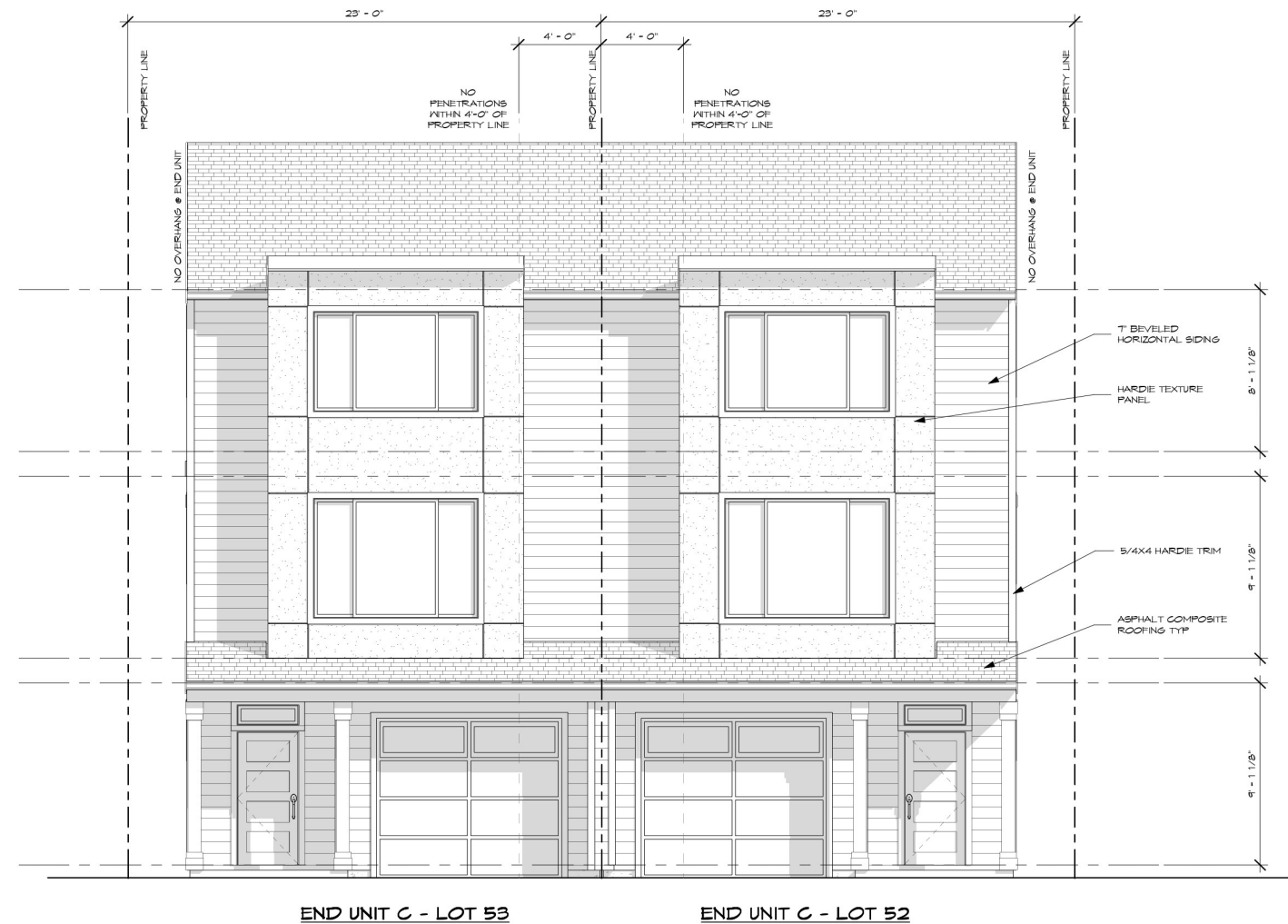
END UNIT C - LOT 53 END UNIT C - LOT 52 FRONT ELEVATION 1/4" = 1'-0"