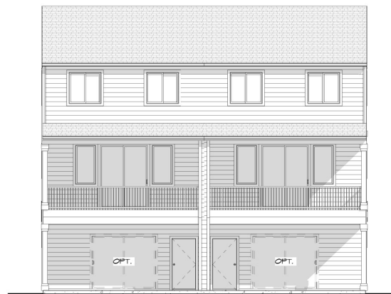
REAR ELEVATION 1/8" = 1'-0"