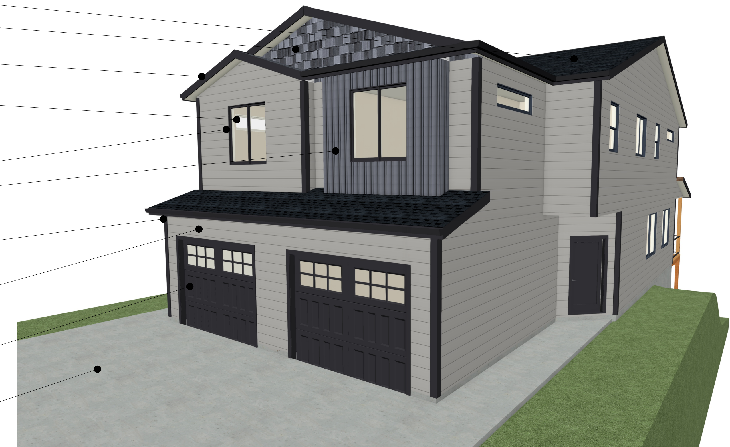
NORTHWEST SIDE PERSPECTIVE