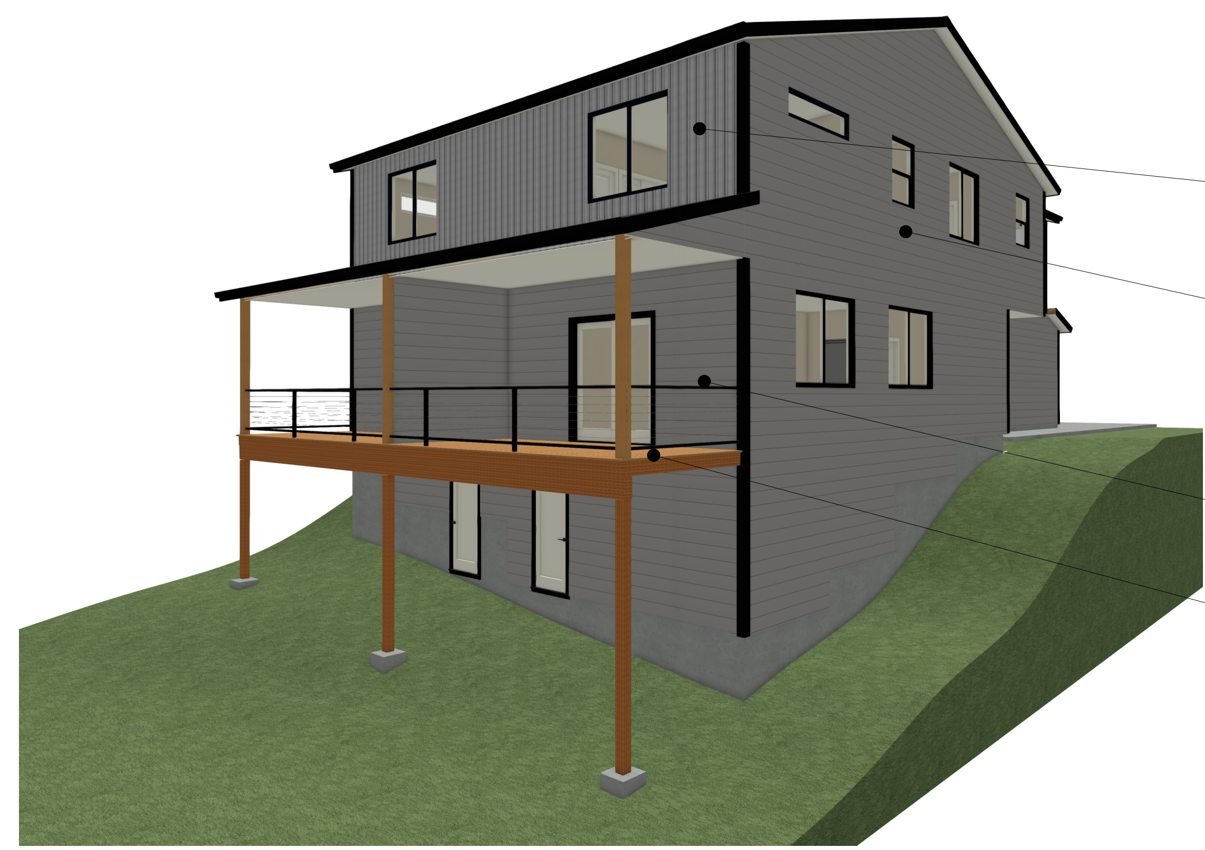
SOUTHEAST SIDE PERSPECTIVE