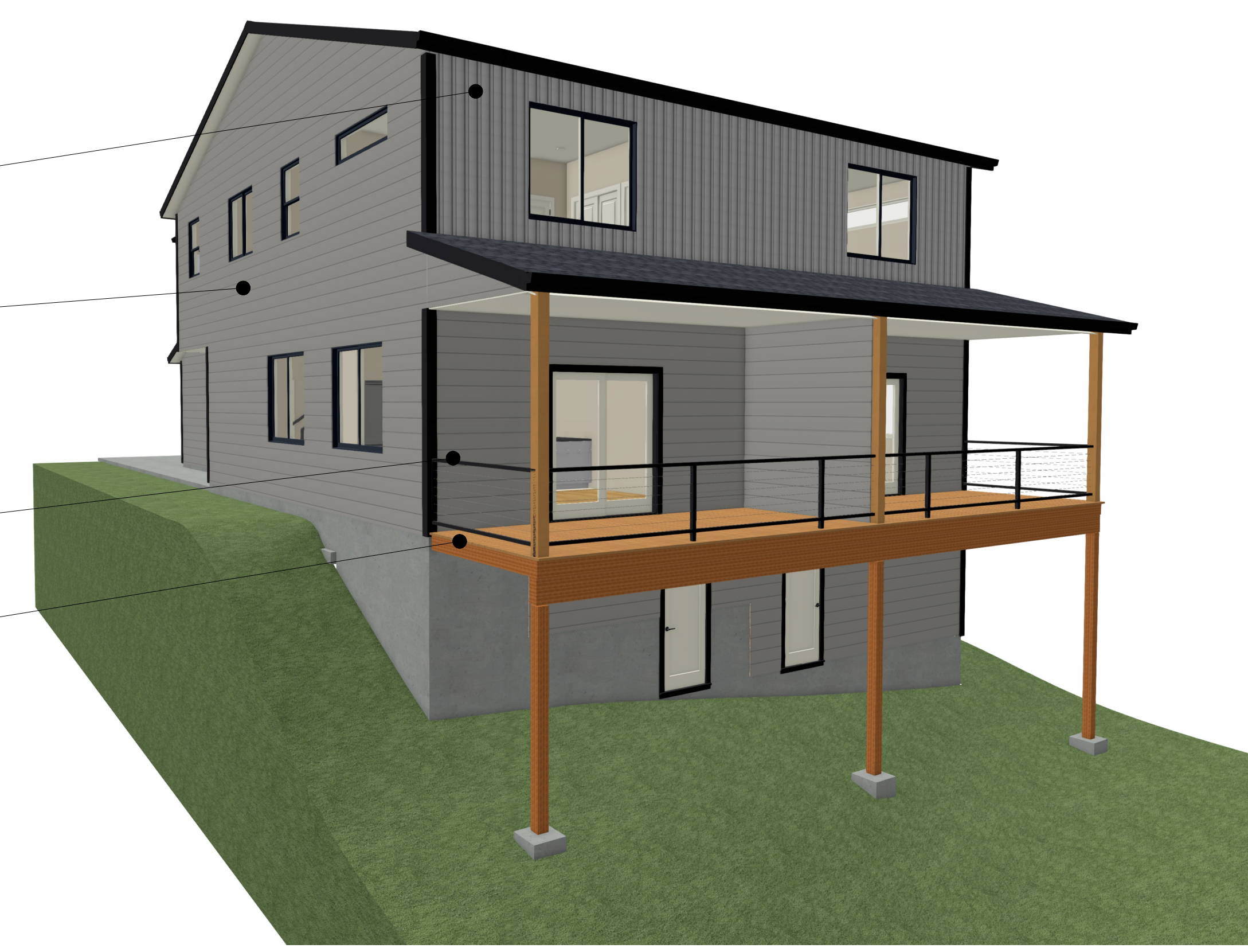
SOUTHWEST SIDE PERSPECTIVE