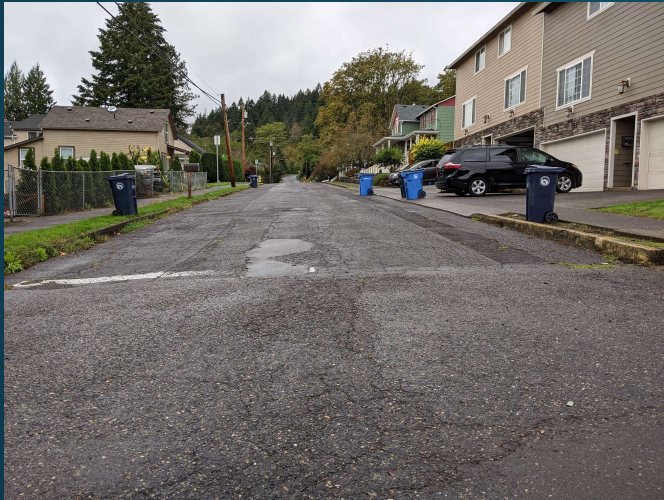
NW 14 TH AVE. AT NW ASH ST. LOOKING WEST