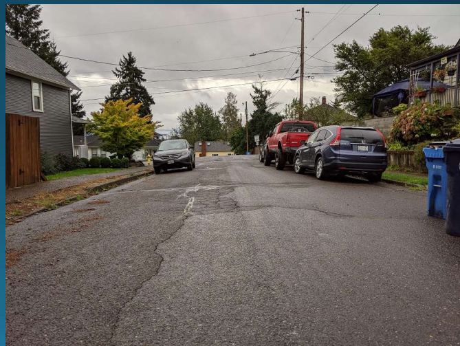
NW BENTON ST. LOOKING SOUTH TOWARDS NW 17 TH AVE.