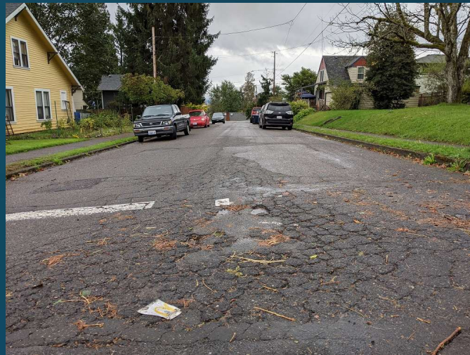
NW BENTON ST. AT NW 18 TH AVE. LOOKING SOUTH