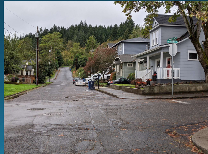
NW 14 TH AVE. AT NW BENTON ST. LOOKING WEST