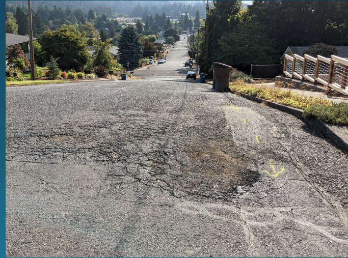
NW 21 ST AVE. LOOKING EAST