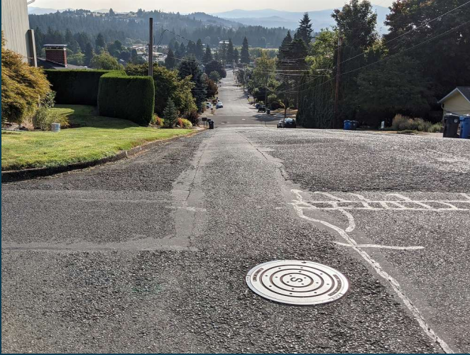
NW 21 ST AVE. AT NW COUCH ST. LOOKING EAST