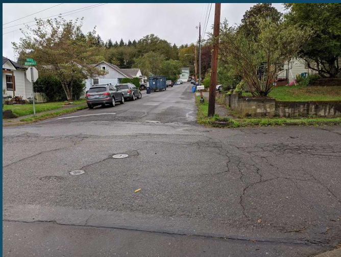
NW BENTON ST. AT NW 17 TH AVE. LOOKING WEST