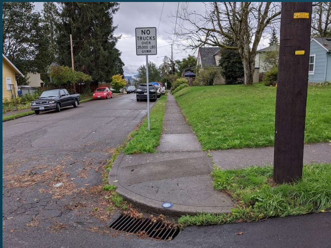
NW BENTON ST. AT NW 18 TH AVE. LOOKING SOUTH