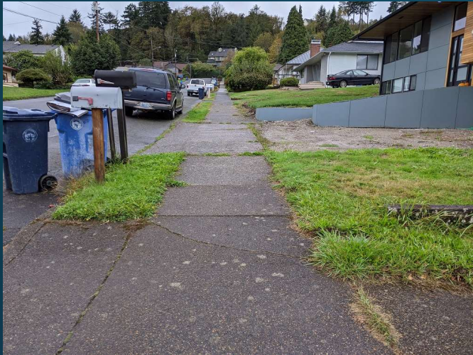
NW 19 TH AVE. LOOKING WEST TOWARDS NW BENTON ST.