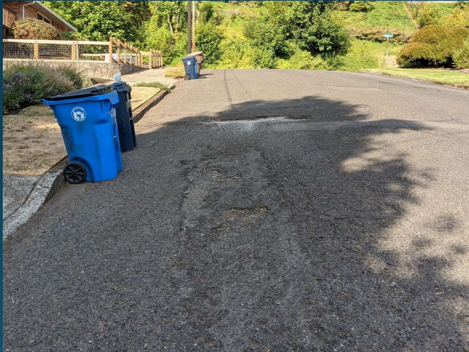
NW 21 ST AVE. LOOKING WEST