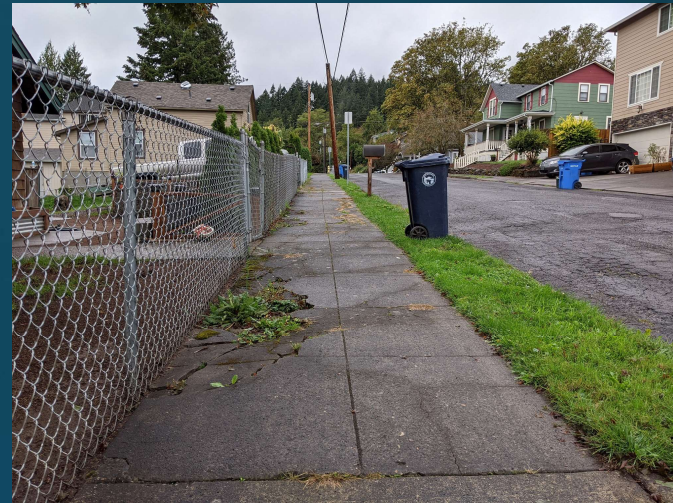
NW 14 TH AVE. AT NW ASH ST. LOOKING WEST