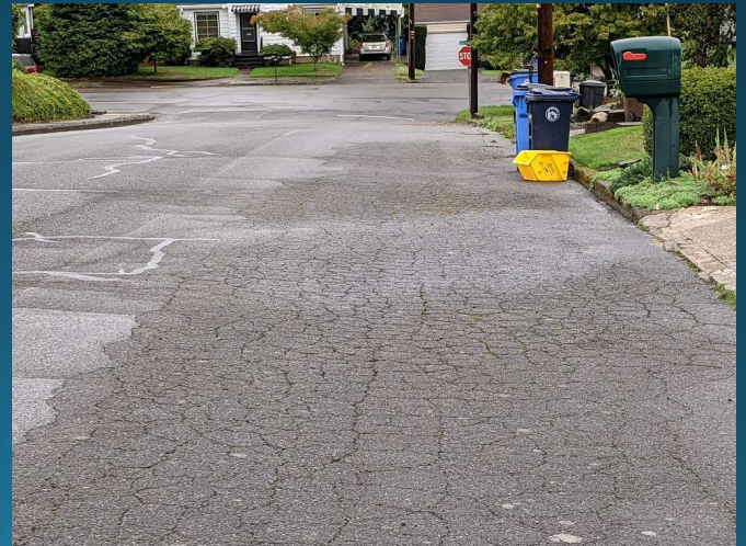
NW 19 TH AVE. LOOKING EAST TOWARDS DIVISION ST.