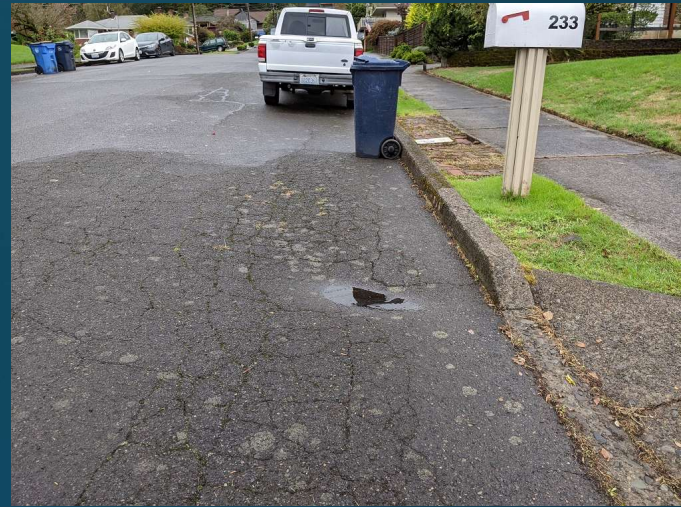
NW 19 TH AVE. LOOKING WEST TOWARDS NW BENTON ST.