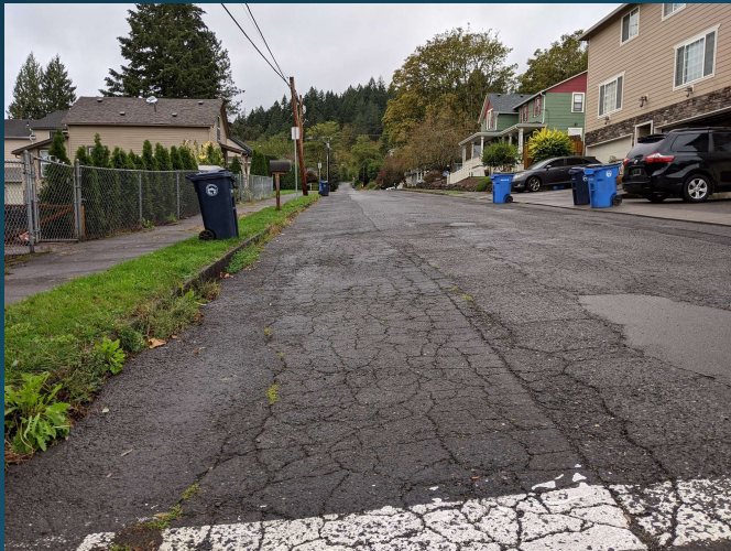
NW 14 TH AVE. AT NW ASH ST. LOOKING WEST