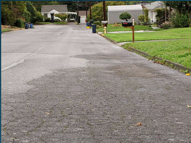
NW 19 TH AVE. LOOKING EAST TOWARDS DIVISION ST.