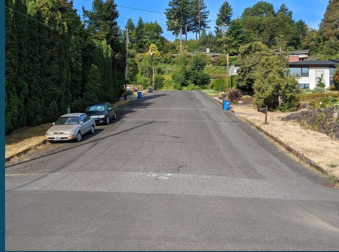
NW 21 ST AVE. AT NW BENTON ST. LOOKING WEST