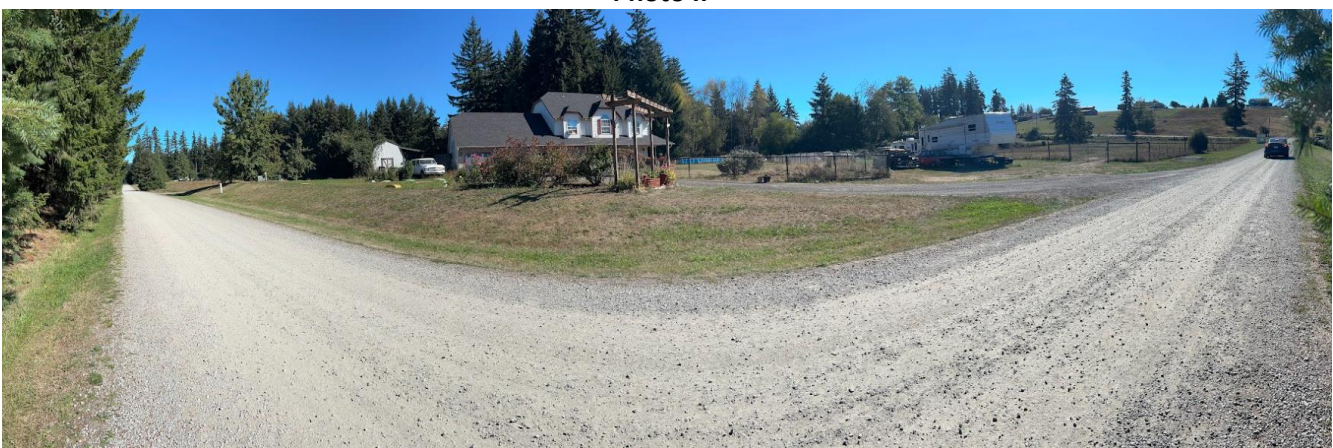
East Adjacent Property (SE 271st Avenue, residential use)