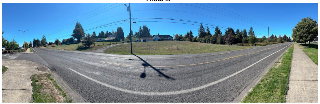
South Adjacent Property (NE 43<sup>rd</sup> Ave., residential use)