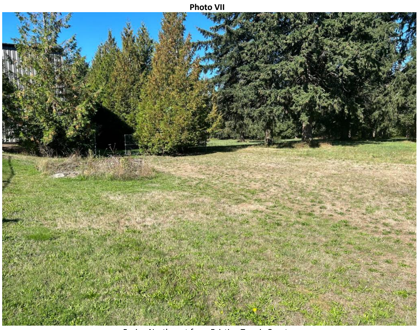
Facing Northwest from Existing Tennis Courts