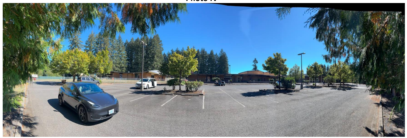
West Adjacent Property (The Heights Learning Center)