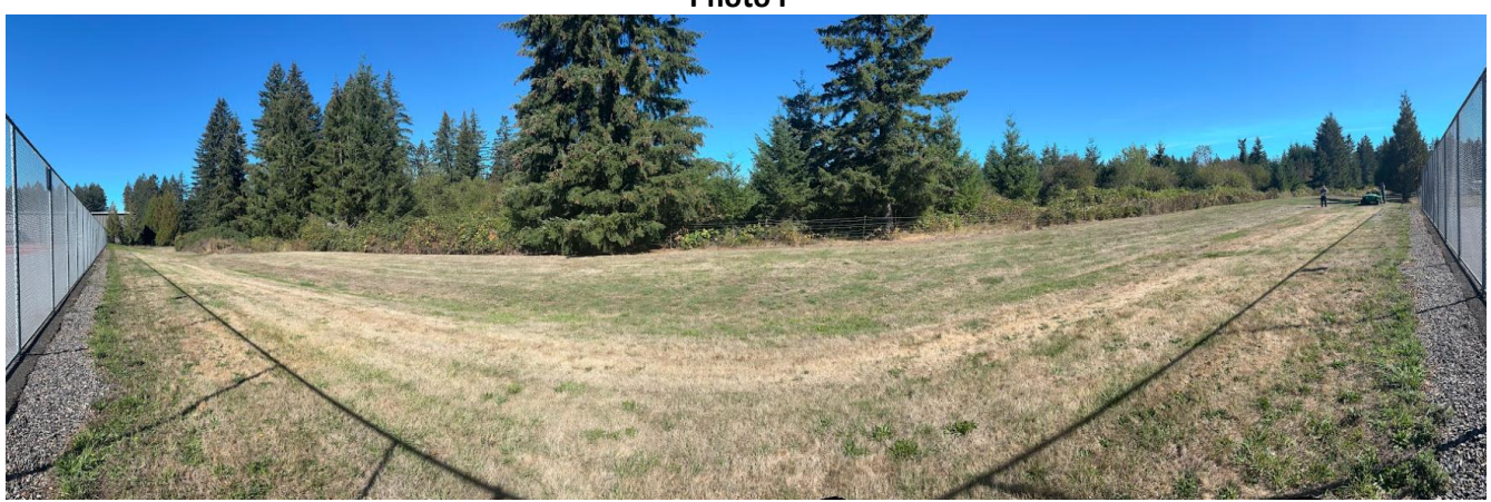
North Adjacent Property (vacant property)