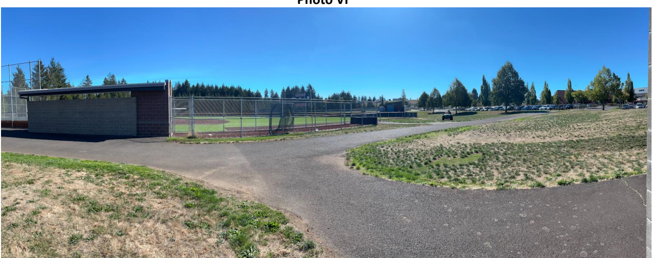
Facing Southeast from Existing Tennis Courts