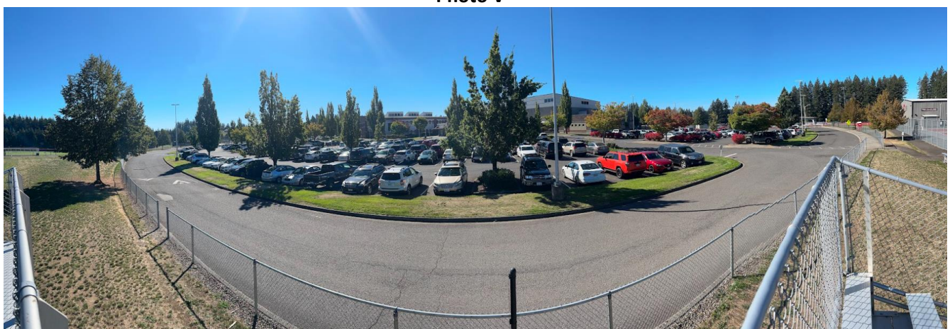
Facing South from Existing Tennis Courts