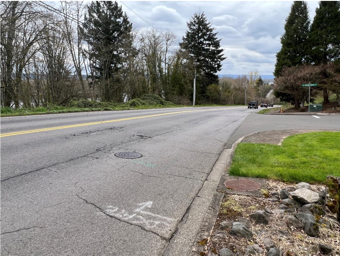
Figure 2: NW Brady Road at Grand Ridge DR Looking West showing Pavement distress.

BENEFITS TO THE COMMUNITY: Improvements to the intersection at Grand Ridge Drive and NW Brady Road will increase safety for all road users while bringing the intersection up to current City Design Standards. This project aligns with the City Pavement Management Program and Transportation Comprehensive Goals and Policies.