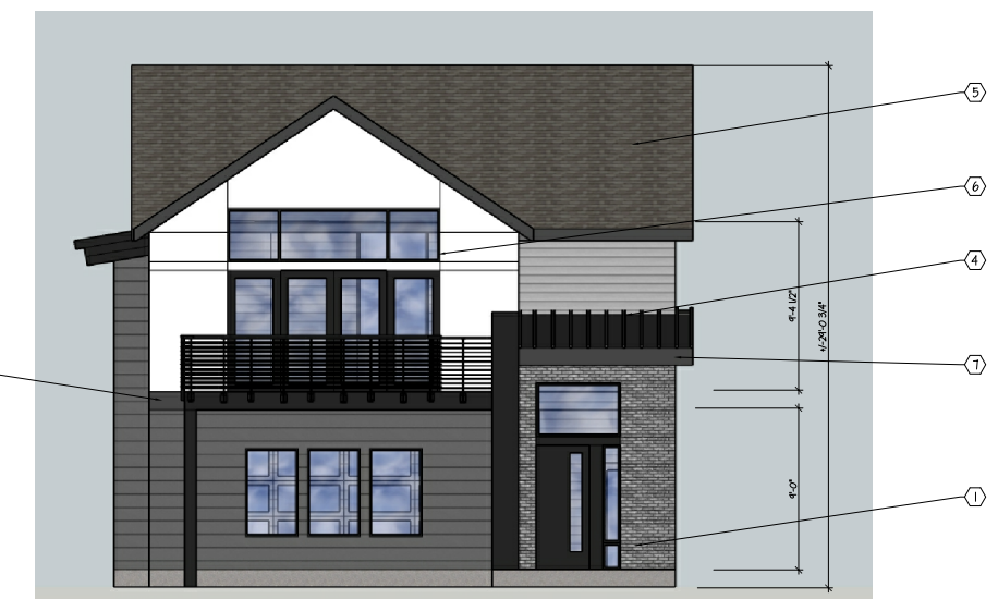
1 FRONT ELEVATION SCALE: 3/16" = 1'-0"