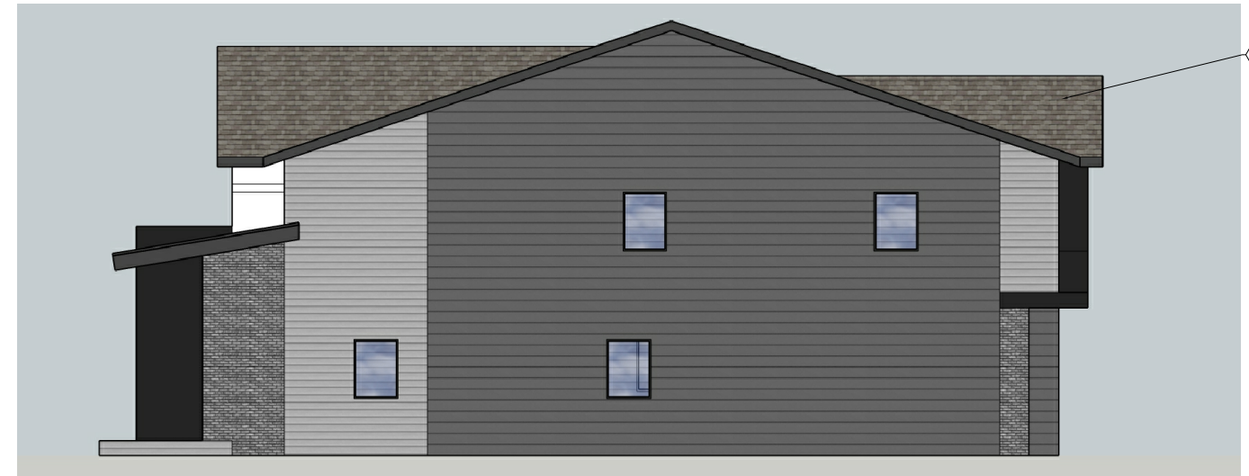
3 RIGHT ELEVATION SCALE: 3/16" = 1'-0"