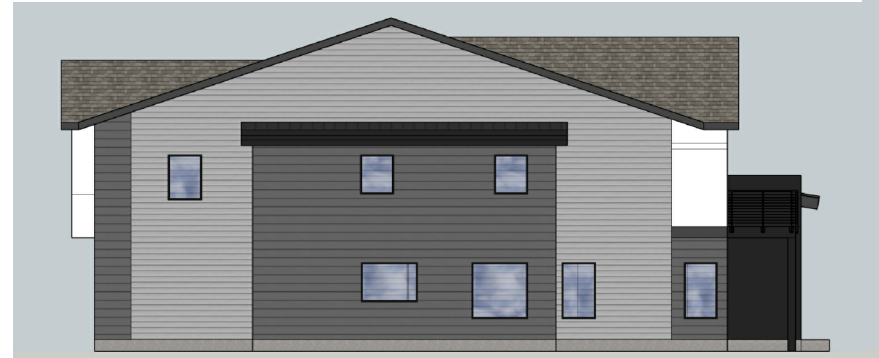
2 LEFT ELEVATION SCALE: 3/16" = 1'-0"