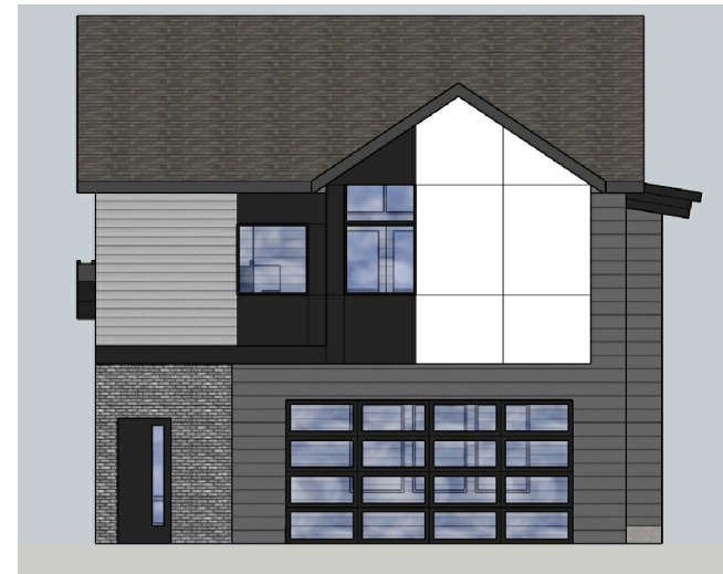
4 REAR ELEVATION SCALE: 3/16" = 1'-0"