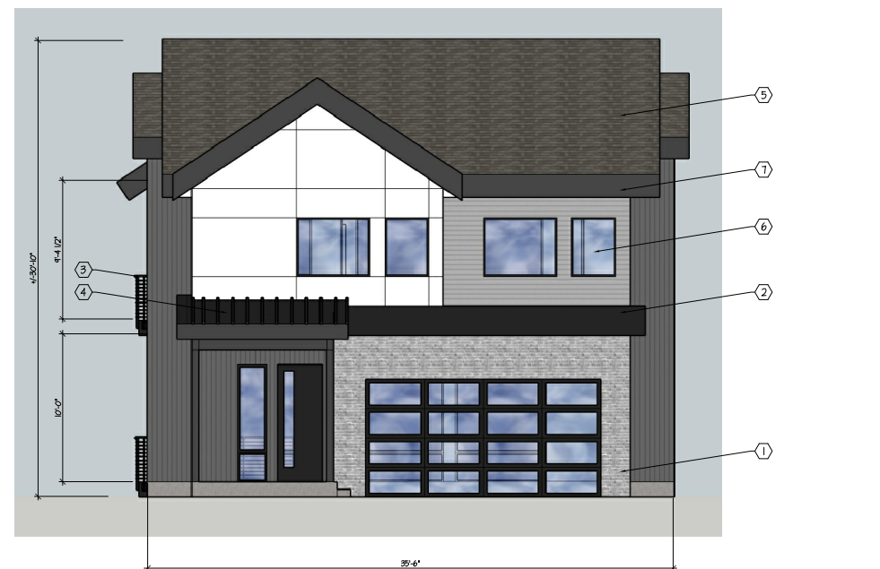
1 FRONT ELEVATION SCALE: 3/16" = 1'-0"