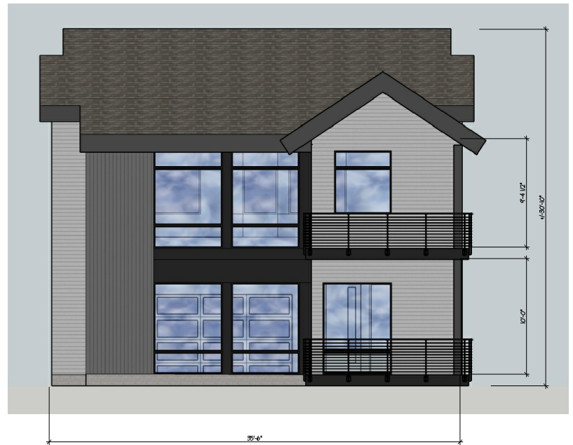
4 REAR ELEVATION SCALE: 3/16" = 1'-0"

CITY OF CAMAS, WA 98 JURISDICTION: CLARK COUNTY, WA