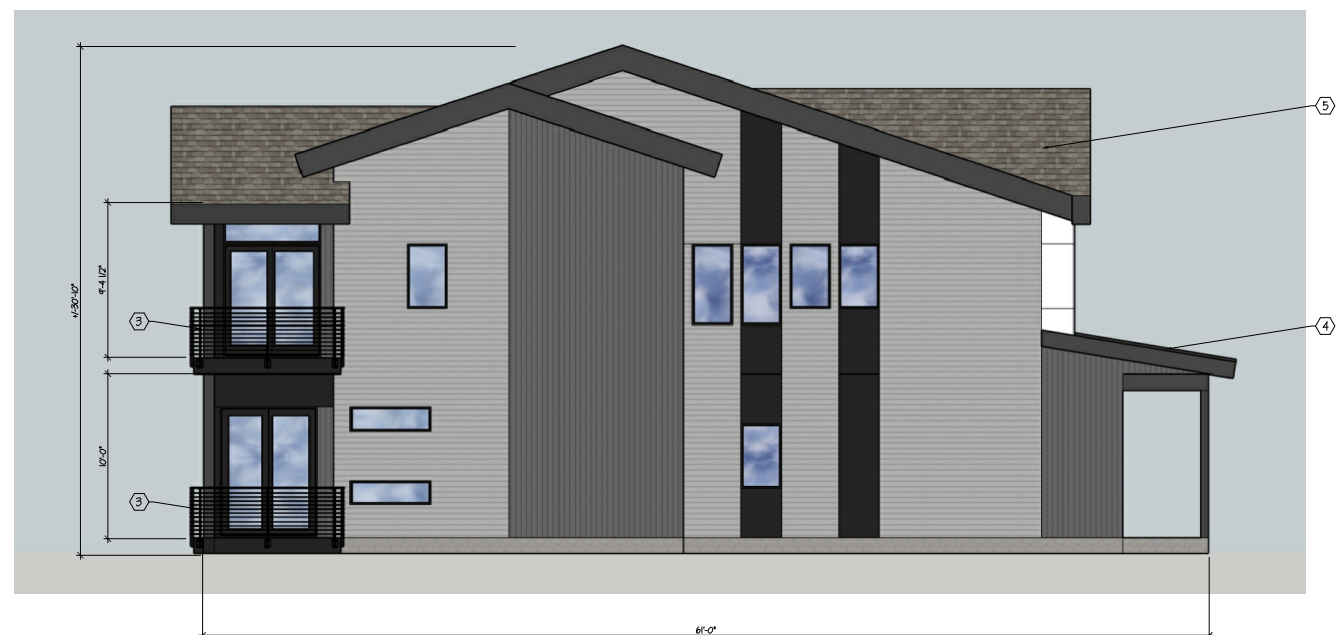
2 LEFT ELEVATION SCALE: 3/16" = 1'-0"